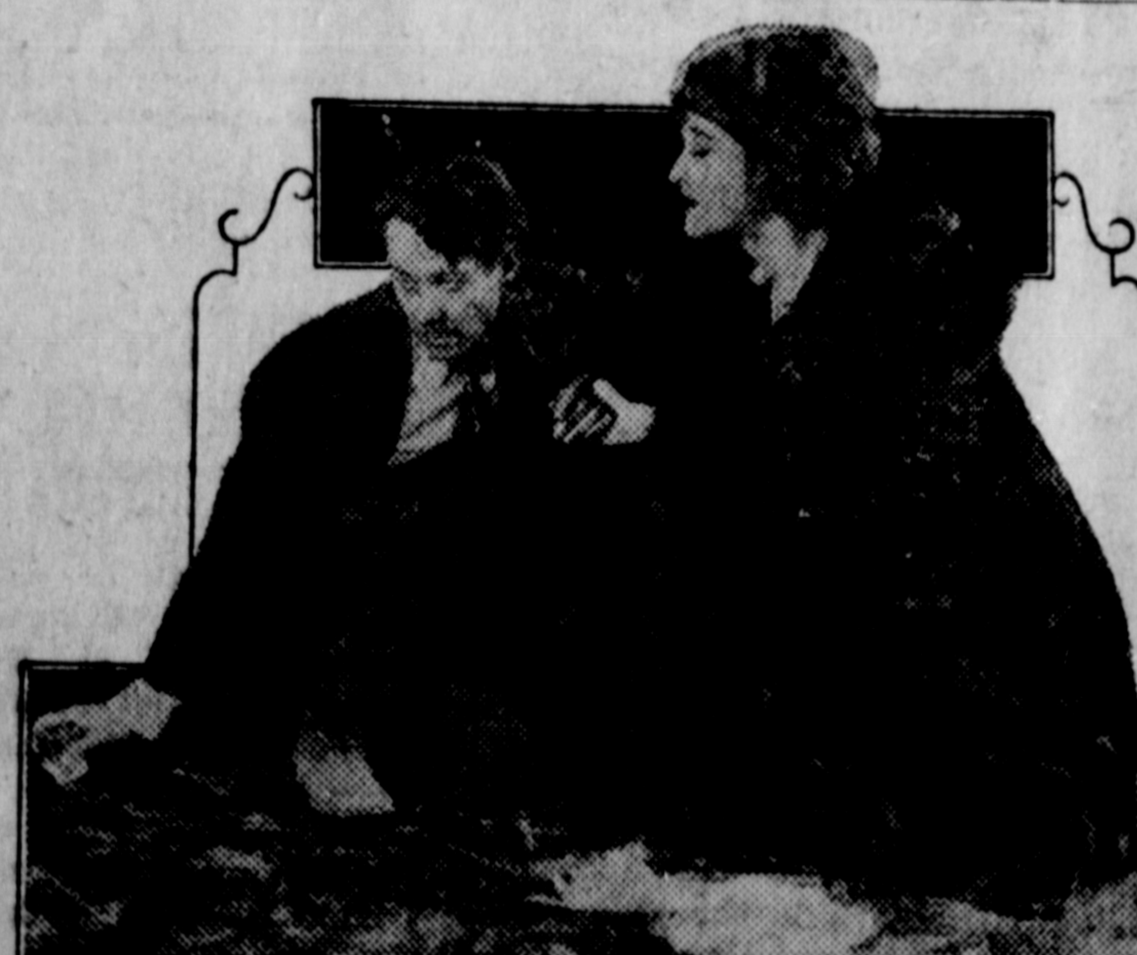
"THE FACE ON THE BARROOM FLOOR" WILLIAM FOX SPECIAL PRODUCTION.

Showing at the Westholme Theatre Wednesday and Thursday.