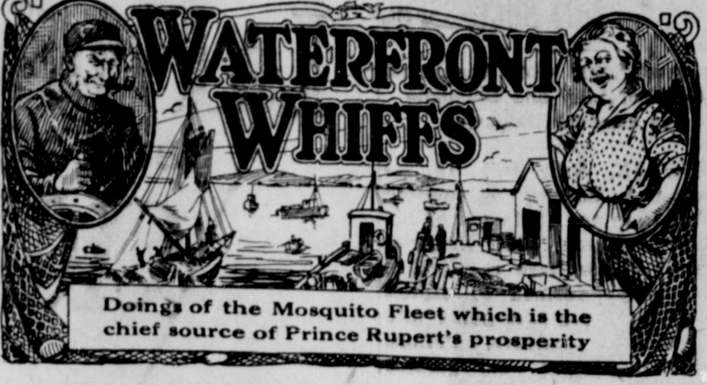
Doings of the Mosquito Fleet which is the chief source of Prince Rupert's prosperity