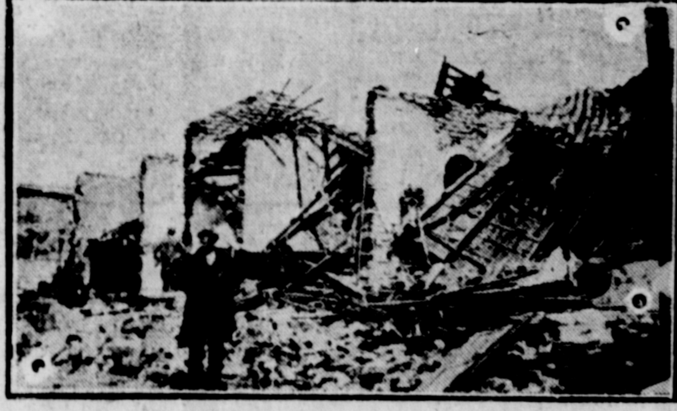
Here's what a disastrous earthquake did to a portion of Costa Rica recently. Photograph shows a street scene in Barrios La Sabana, near San Jose.

Soviet Bands Cross Frontier and Kill or Wound Many People WARSAW, May 22.—All Poland is aroused as a result of despatches from the Eastern regions to the effect that a robber band numbering one hundred armed men passed over the Soviet frontier killing or wounding some twenty inhabitants including a church pastor. The robbers cut the telegraph and telephone wires and escaped back to Russia.