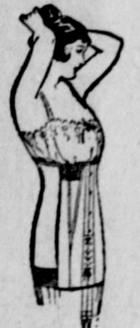
Nemo Light Service Special Models Sizes 20-30 $3.00 to $10.00

Women now appreciate, more so than ever, the many superior features of the Nemo Corset. Among the many models and styles available there is a Nemo Corset that meets exactly the individual requirements of your figure. The scientific construction of the Nemo provides ample and comfortable support, while their design insures a proper corset foundation for the new frocks and suits. Ask to see the new low bust models.