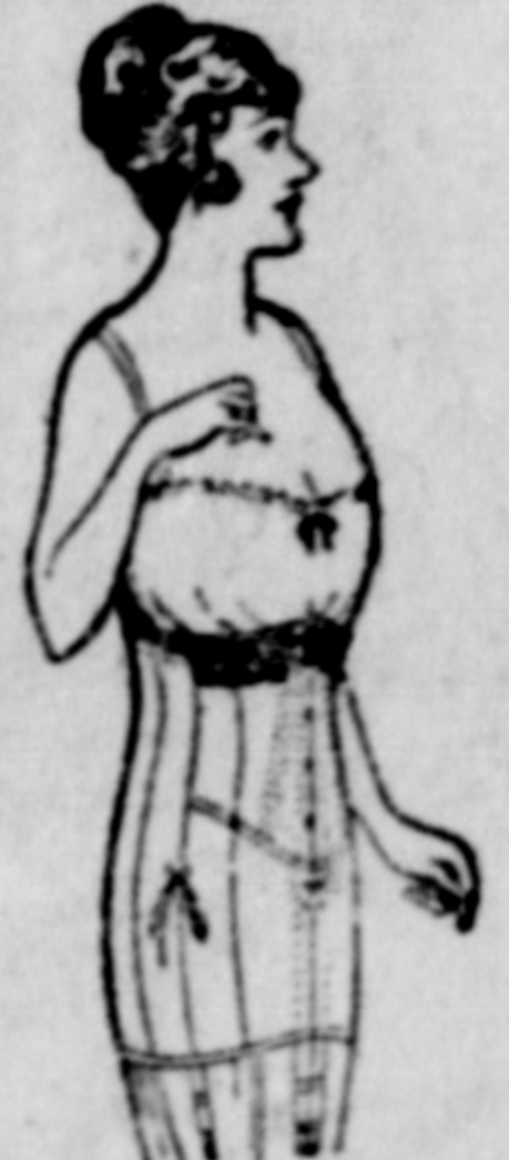
Nemo Underlight Service Models for every type of figure Sizes 22-34 $7.00 to $11.00