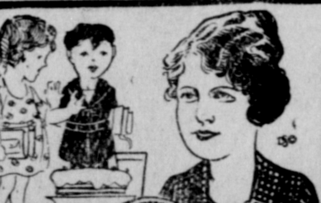
TABLE TALKS BY The Housewife

TOKIO, Sept. 9.—Severe wind and rain storms in Formosa caused 30 deaths. There were 312 injured and eight thousand homes destroyed or damaged.