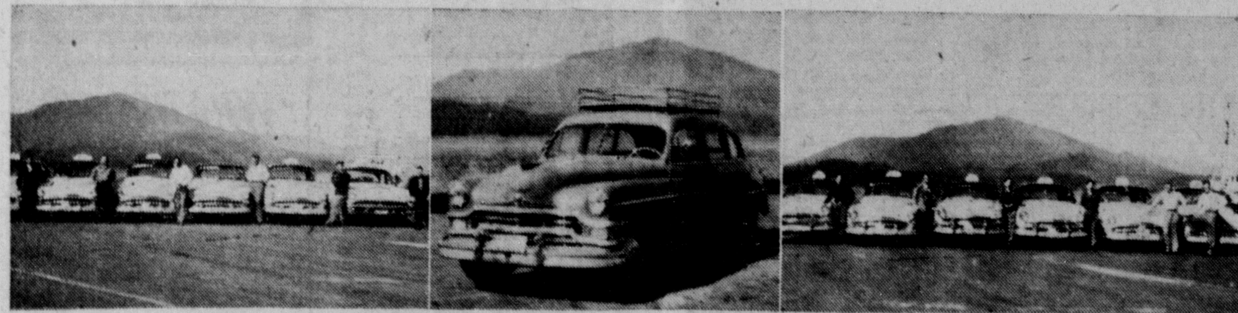
THE LARGEST FLEET OF TAXIS IN THE CITY