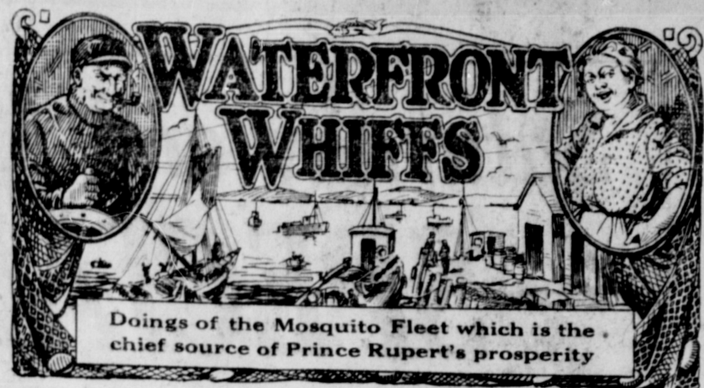
Doings of the Mosquito Fleet which is the chief source of Prince Rupert's prosperity

Phone 68. Cartage, Warehousing, and Distributing Team or Motor Service. Coal Sand and Gravel We Specialize in Piano and Furniture Moving.