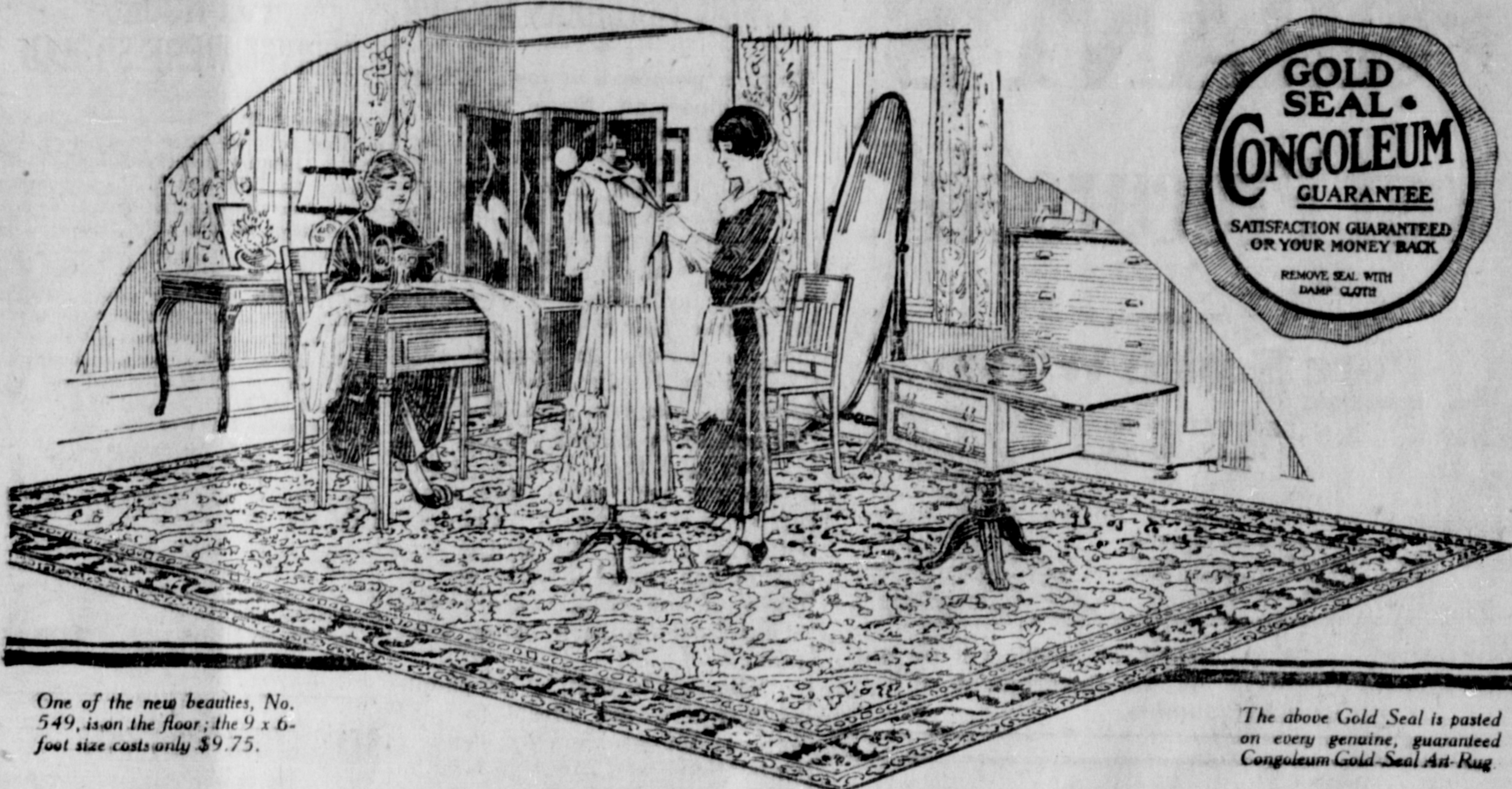
One of the new beauties, No. 549, is on the floor; the 9 x 6-foot size costs only $9.75.

Whist and games were enjoyed and Mayor Newton, with an ap-