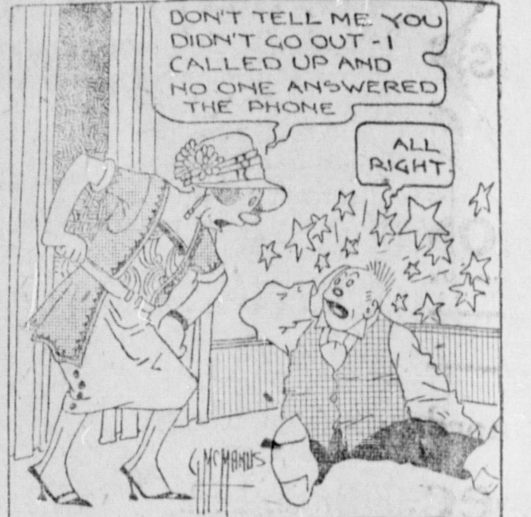
©1925 BY INT'L FEATURE SERVICE, INC. Great Britain rights reserved. 1-7