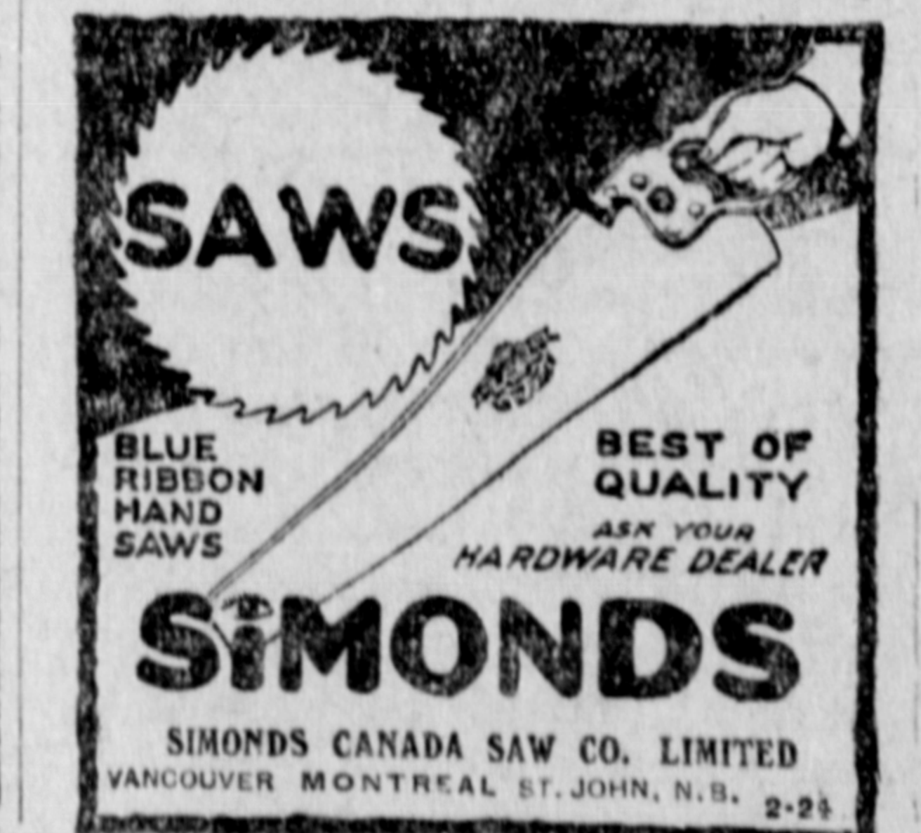
SIMONDS CANADA SAW CO. LIMITED VANCOUVER MONTREAL ST. JOHN, N.S. 2-21

Knights of Pythias whist drive and dance, March 23. Musical evening in Baptist Church, March 26, to 8 p.m. Catholic Spring Sale, afternoon of April 20, Metropole Hall followed by social evening. Weekly Cinderella Dance, Saturday night, Elks' Home, 50c.