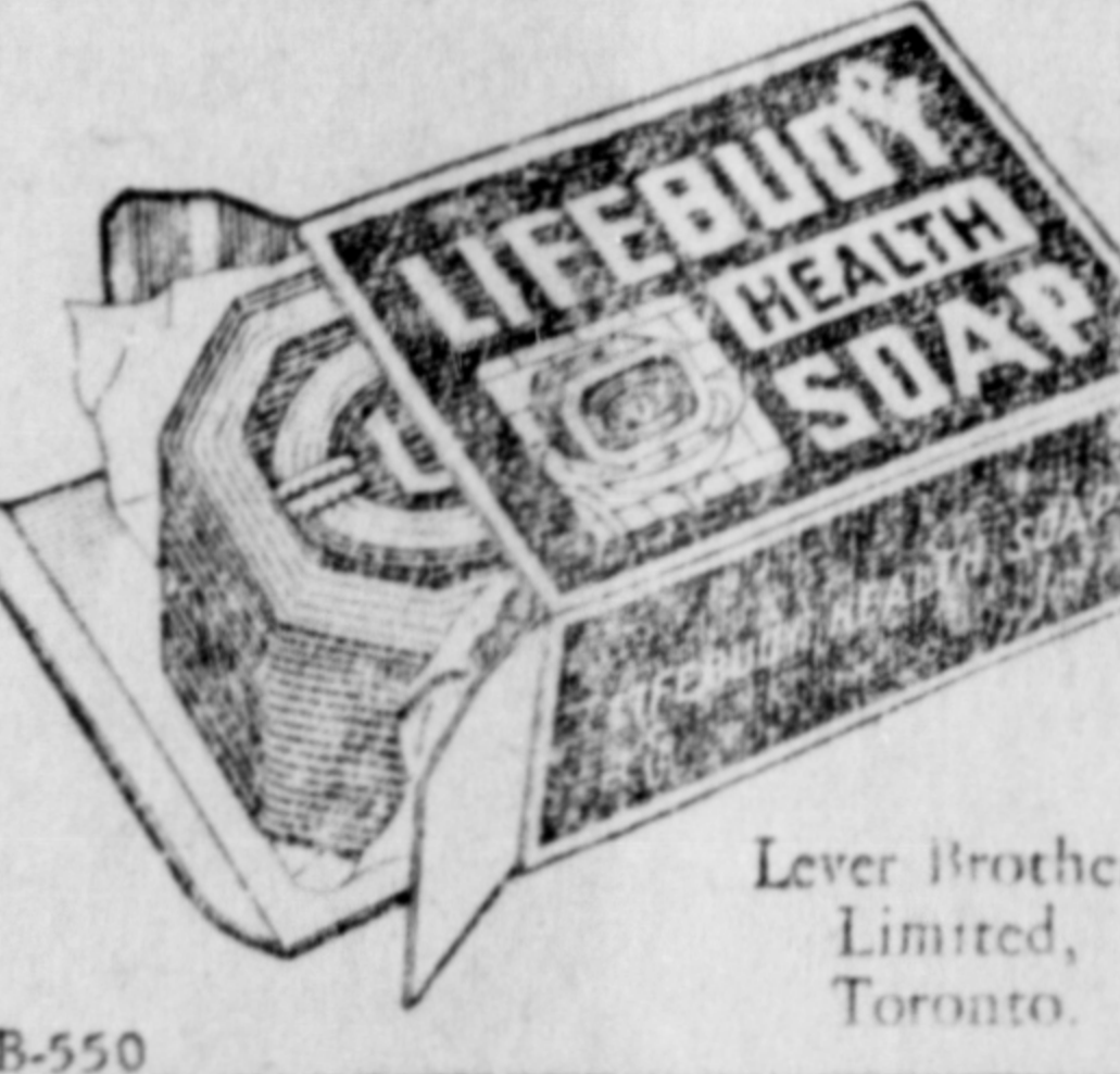
Lever Brothers Limited, Toronto.

She knows that dust and dirt contain dangerous disease germs. So she guards the health of her family by the use of Lifebuoy. Its soothing, creamy lather carries a wonderful health element deep into every pore, removing all impurities from the skin. The health odour vanishes quickly after use.