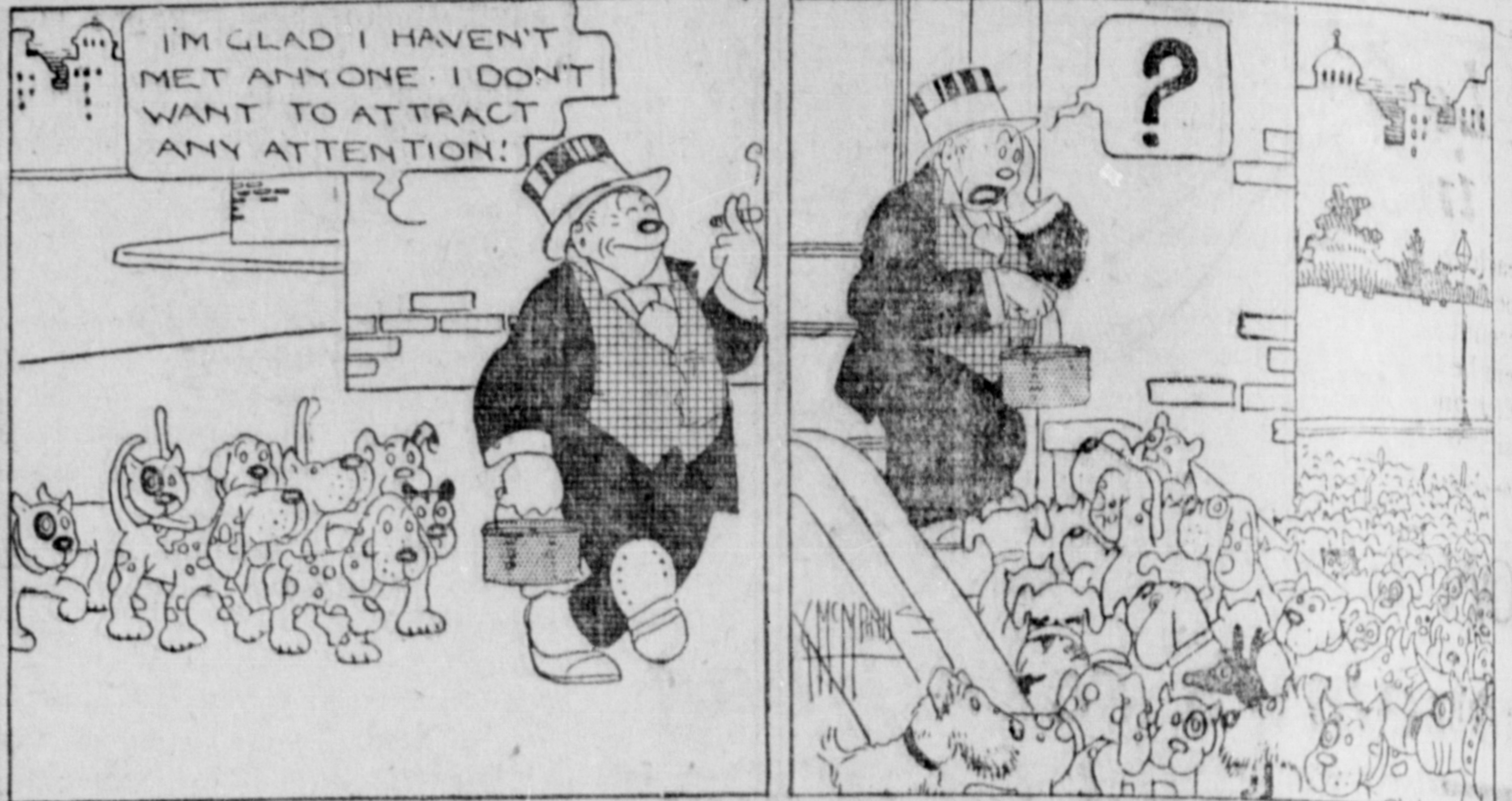
By George McManus

by burying it and the Englishman made his game high by hanging it. Neither of these methods were applied in handling fish which must be placed on the market while fresh. He then traced how Prince Rupert fish found its way to the most distant parts of the world and said that the reputation of Prince Rupert depended on the quality of the fish marketed.