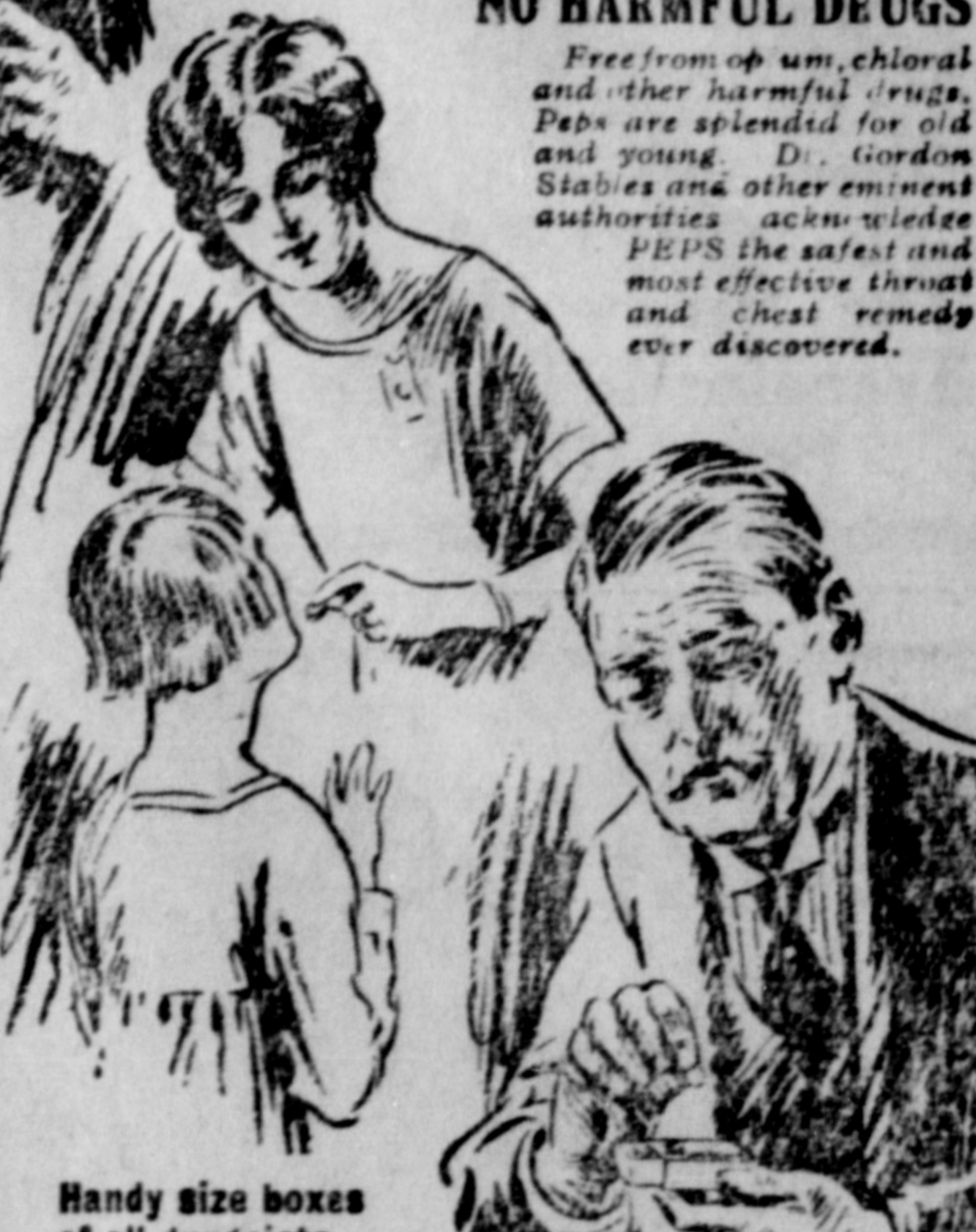
Handy size boxes of all druggists.