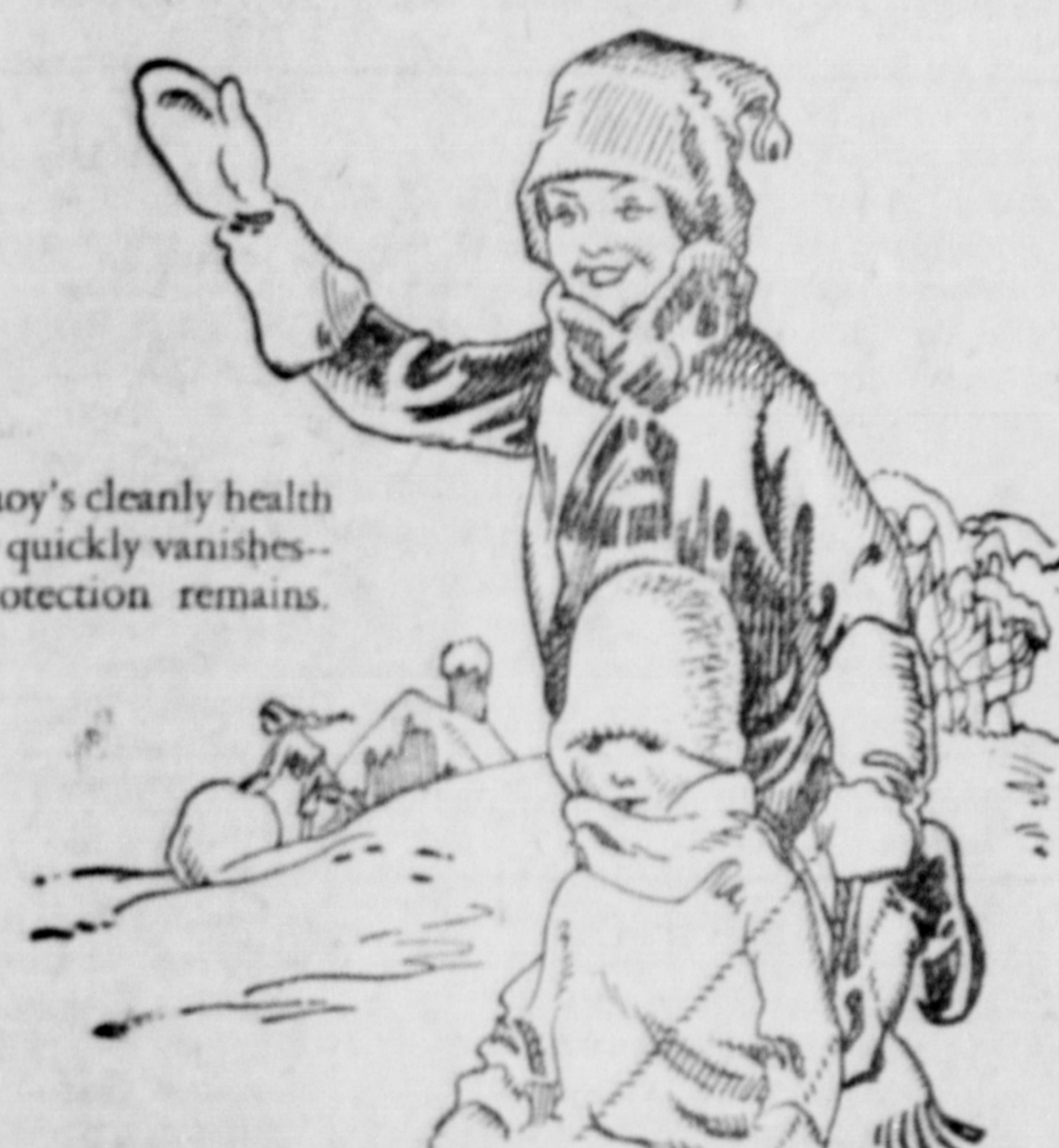
Lifebuoy's cleanly health odour quickly vanishes—the protection remains.

Lifebuoy, the ultra-refined, world's most widely used soap, is an inexpensive protective necessity.