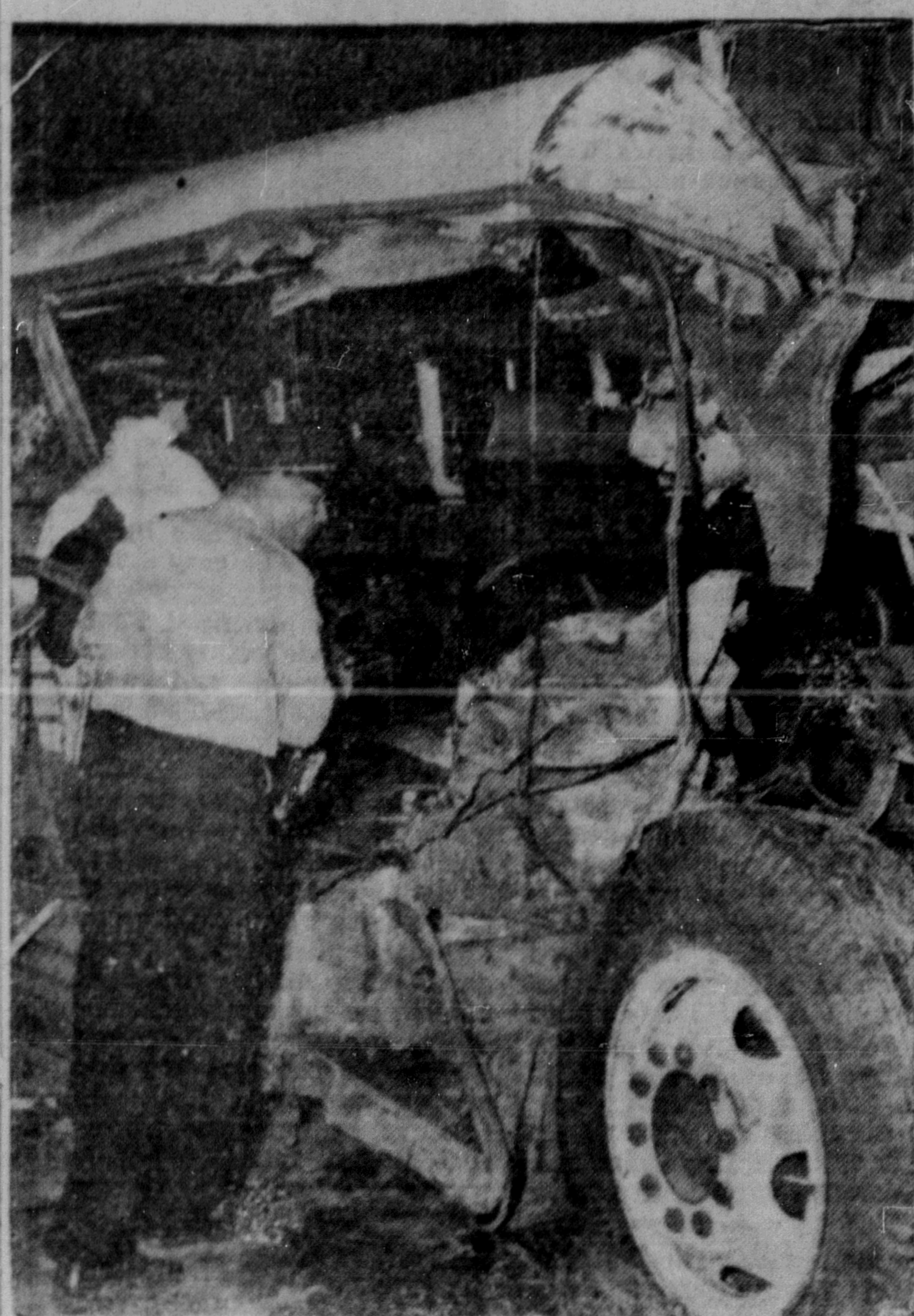
THREE WERE KILLED and 25 other persons injured when a Toronto bus and truck collided on a highway recently. Each city has its "boneyard" of automobile wrecks, many of which tell a story not only of property loss, but of injury and death. Care in driving can prevent many accidents.

Prince Rupert Daily News Tuesday, October 21, 1952