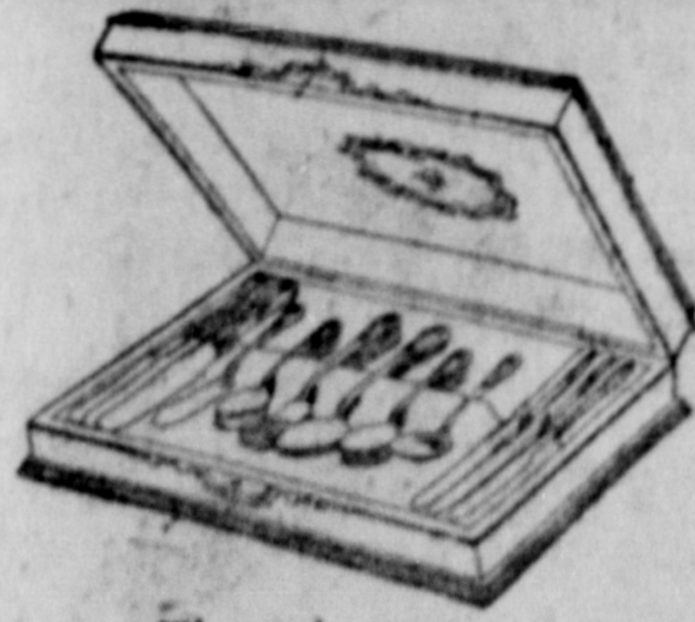
The 31-piece "COURT CABINET"

The charm that surrounds Hampton Court—latest achievement of Community designers—has been greatly enhanced by the introduction of this splendid chest.