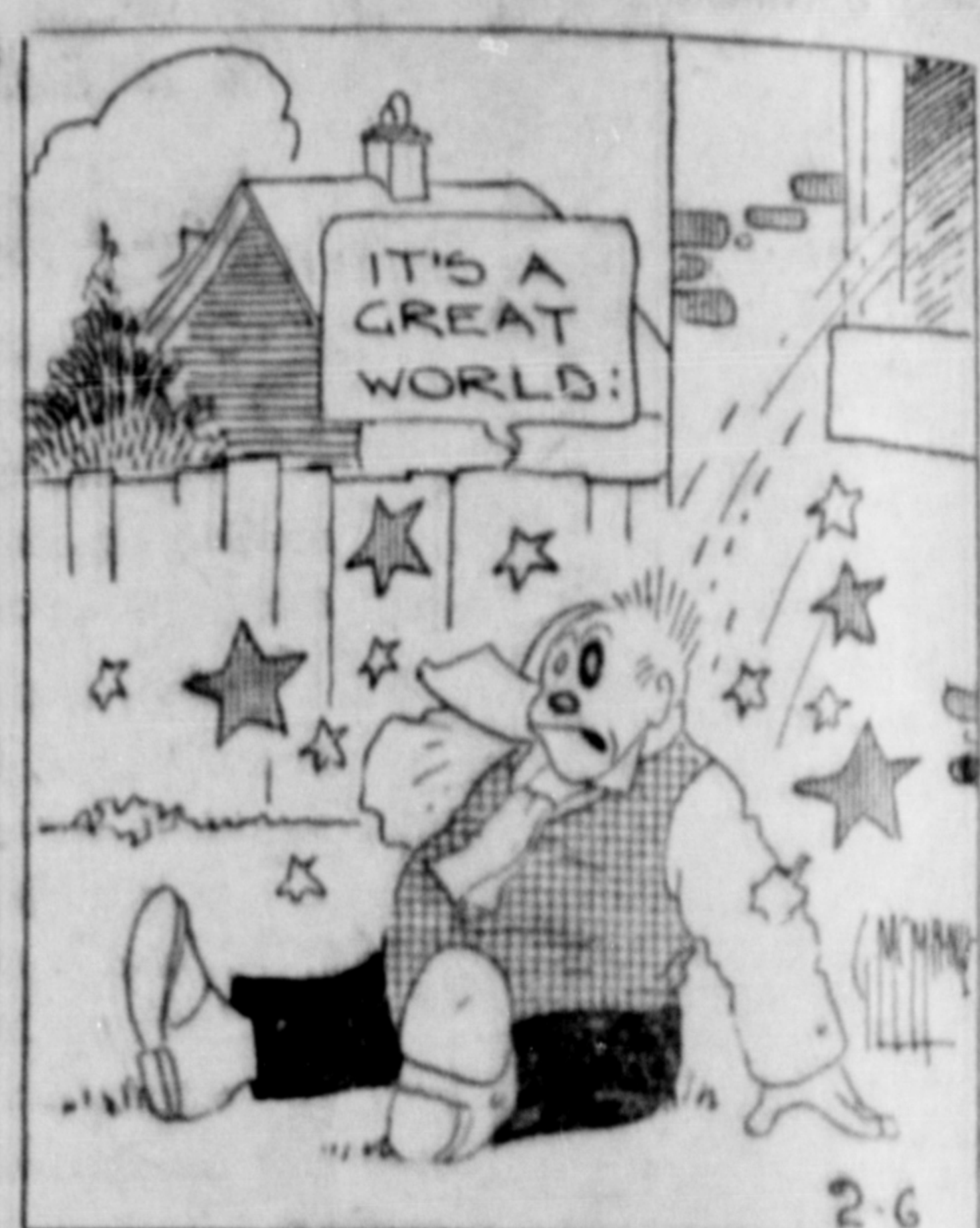
© 1926 BY INT'L. FEATURE SERVICE, INC. Great Britain rights reserved.