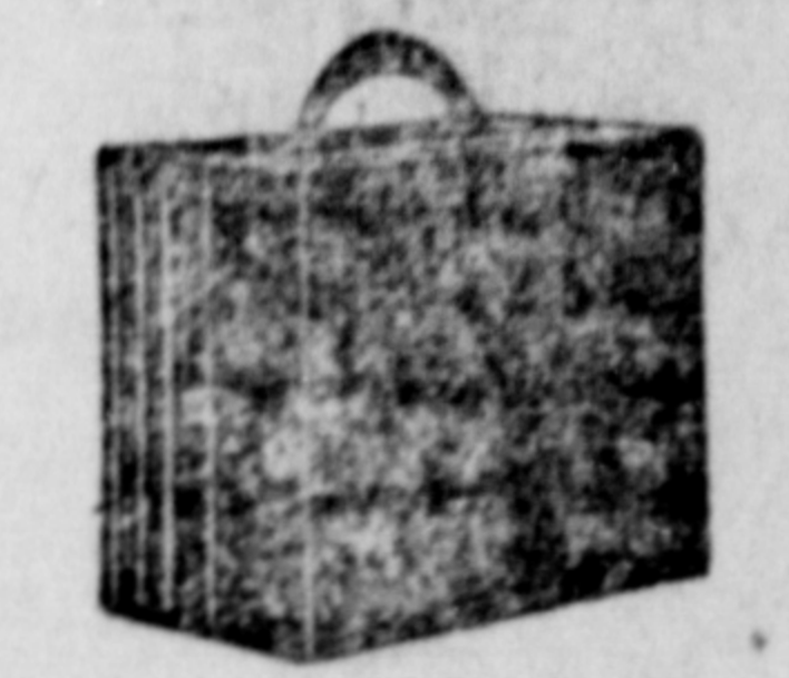
Model 1-6 (closed) Price $39.00

A Christmas gift that entertains —always