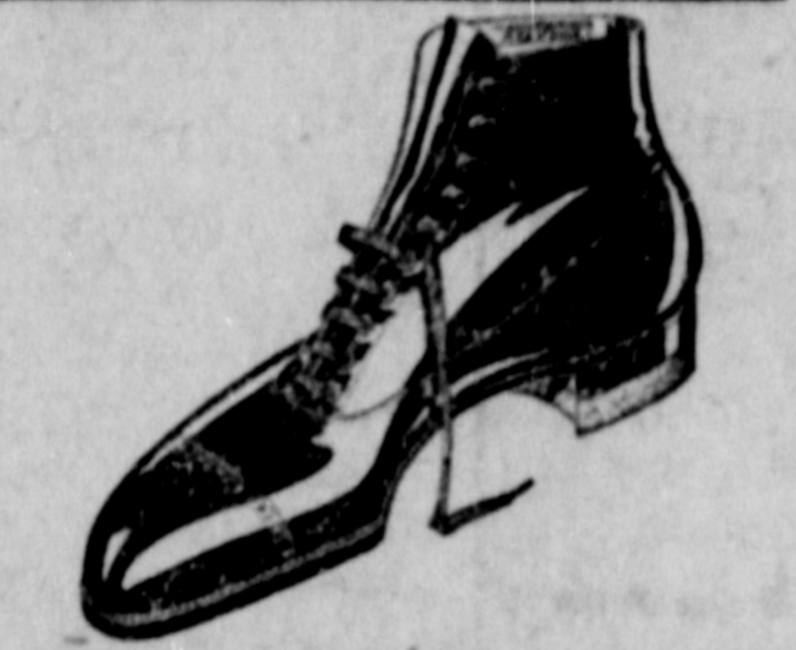
"Imaginary" Rheumatism Caused by Illfitting Shoes

MANY, many times physicians have diagnosed what appears to be rheumatism, as really being pains arising from the effects of Fallen Arches.