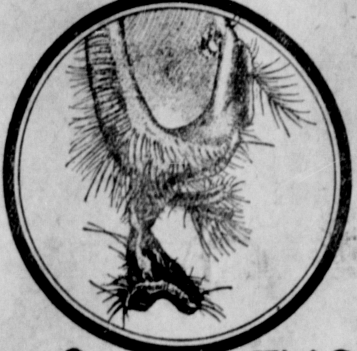
Fly's Tongue Magnified