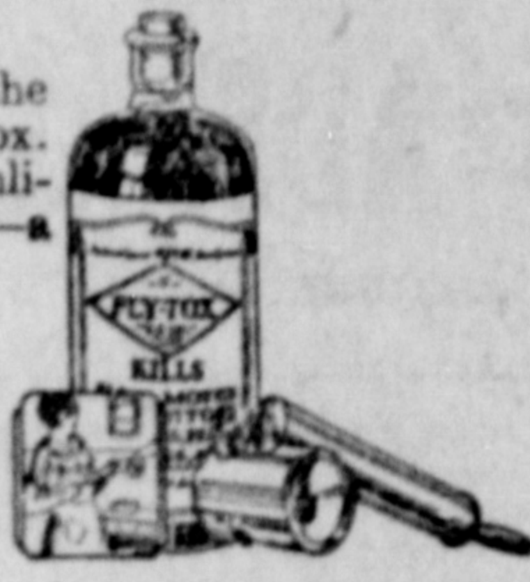
Made in Vancouver, B. C.

Flies must be killed. Millions have found the safest, cleanest, surest way is with Fly-Tox. Kill the flies. Then there is health, cleanliness and that wonderful summer comfort—a house without flies and mosquitoes.