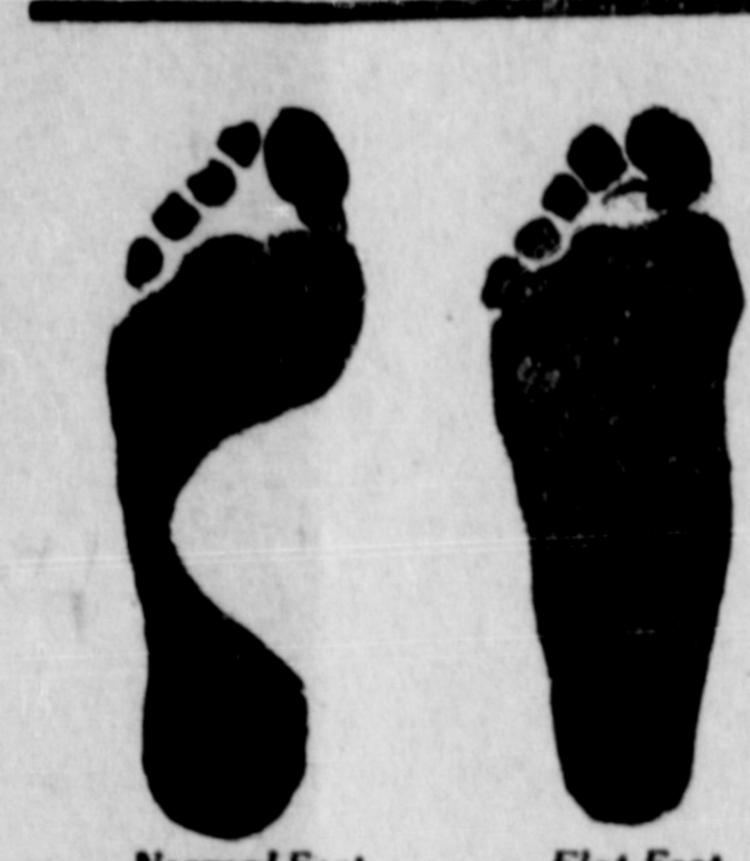
Normal Foot Flat Foot