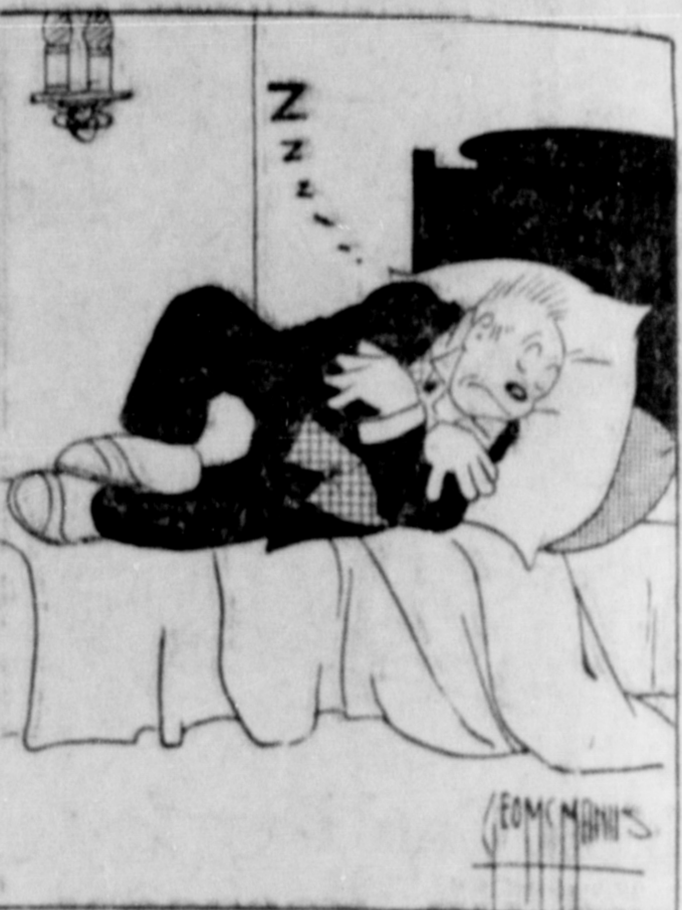
© 1926 BY INT'L. FEATURE SERVICE, INC. Great Britain rights reserved 3-16