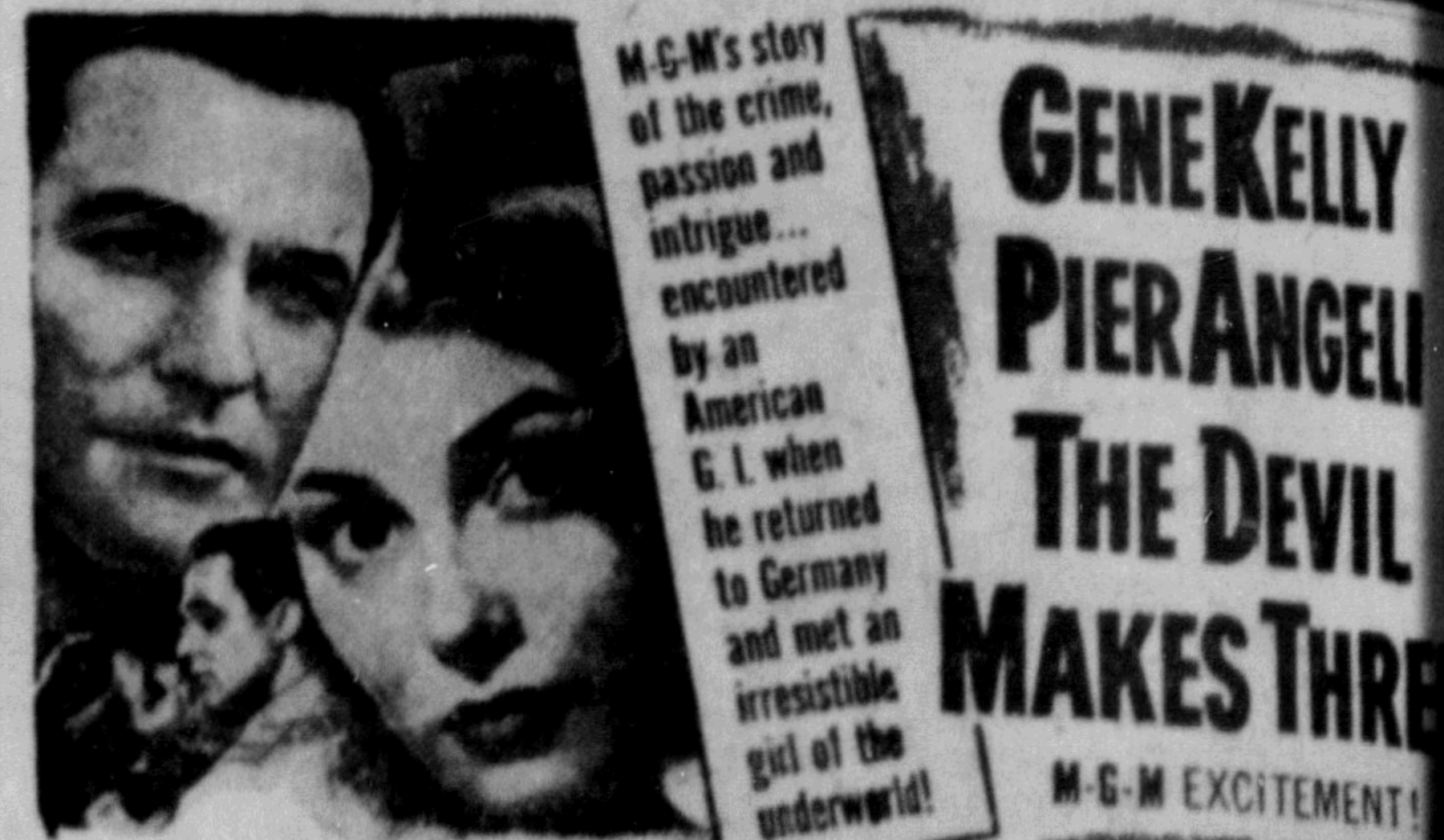
M-G-M's story of the crime, passion and intrigue... encountered by an American G. I. when he returned to Germany and met an irresistible girl of the underworld!

—Also— "PRETORIA TO DURBIN" CARTOON - NEWS Evenings 7 - 9:09 SATURDAY MATINEES 2 - 4:25