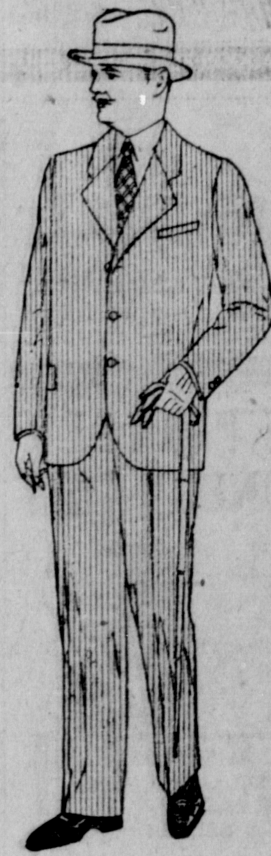
The illustration above shows a correct Tip Top style for Spring.

cloths we are showing now for Spring wear. You have your unrestricted choice of any Tip Top material in our store at one standard price and you cannot equal such clothes value anywhere else in Canada. Come in today.