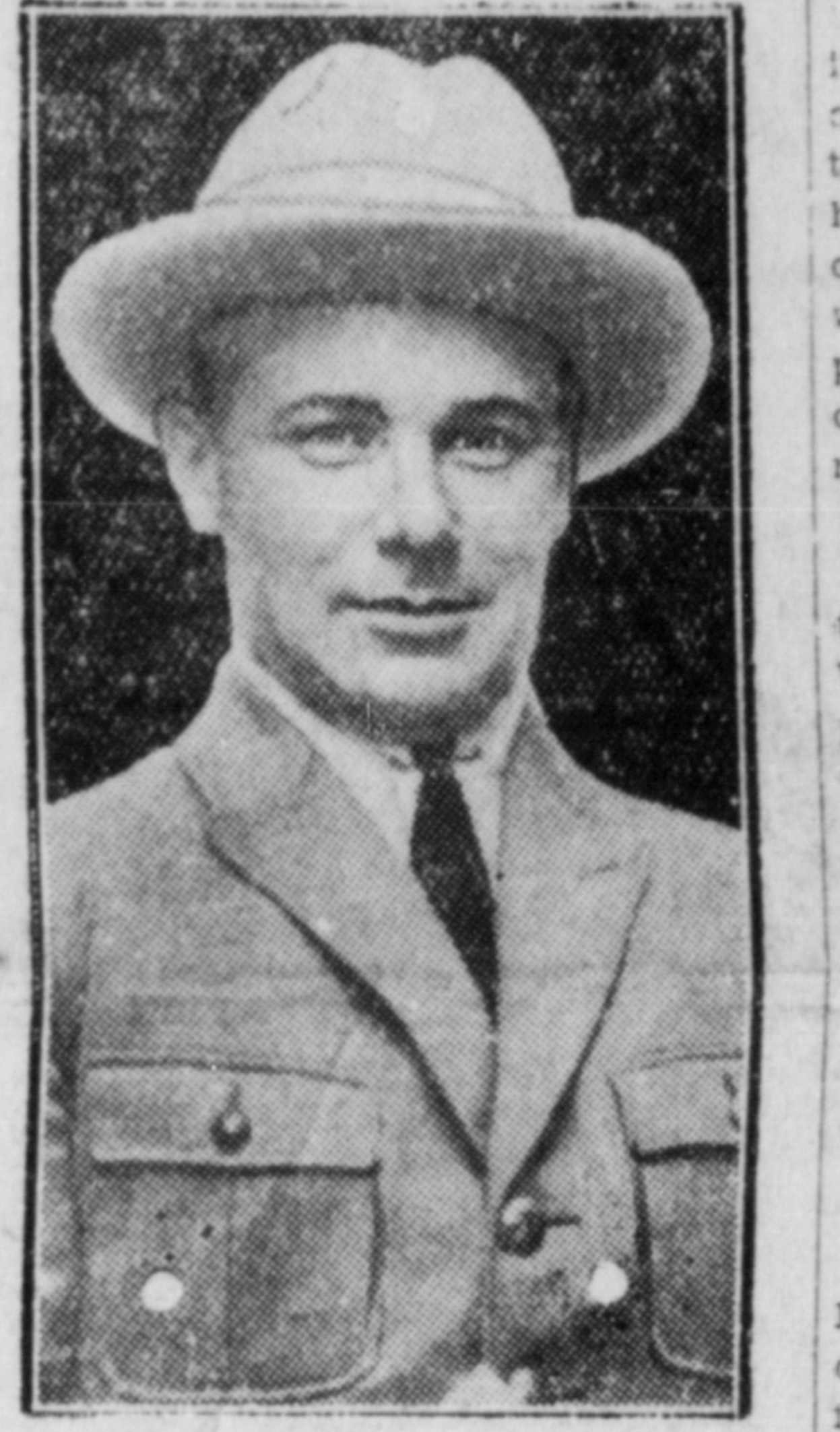
GERMAN WAR ACE: Ernst Udet announces arrangements for a flight from Berlin to New York