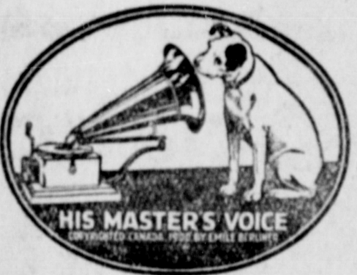
Victor Talking Machine Co.