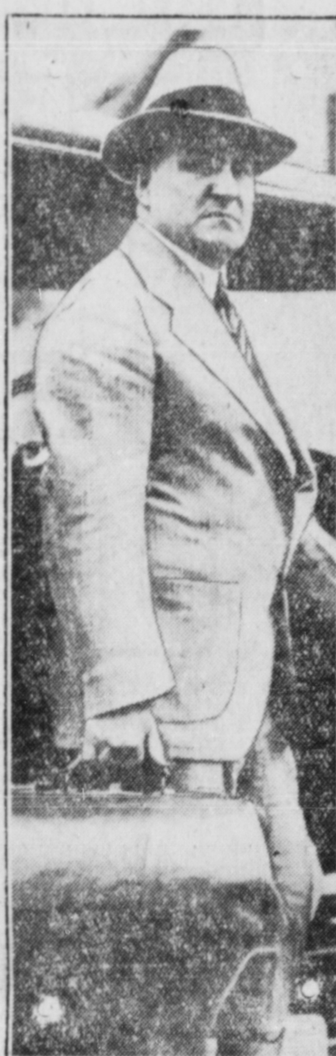
GEORGE REMUS, former king of American bootleggers, snapped on his return to Cincinnati, Ohio, after more than two years spent in various prisons. He is reputed to have made $5,000,000 in bootleg profits.

Monthly general meeting in the Club Rooms on Wednesday, July 13, at 8 p.m. All members requested to attend. Important business.