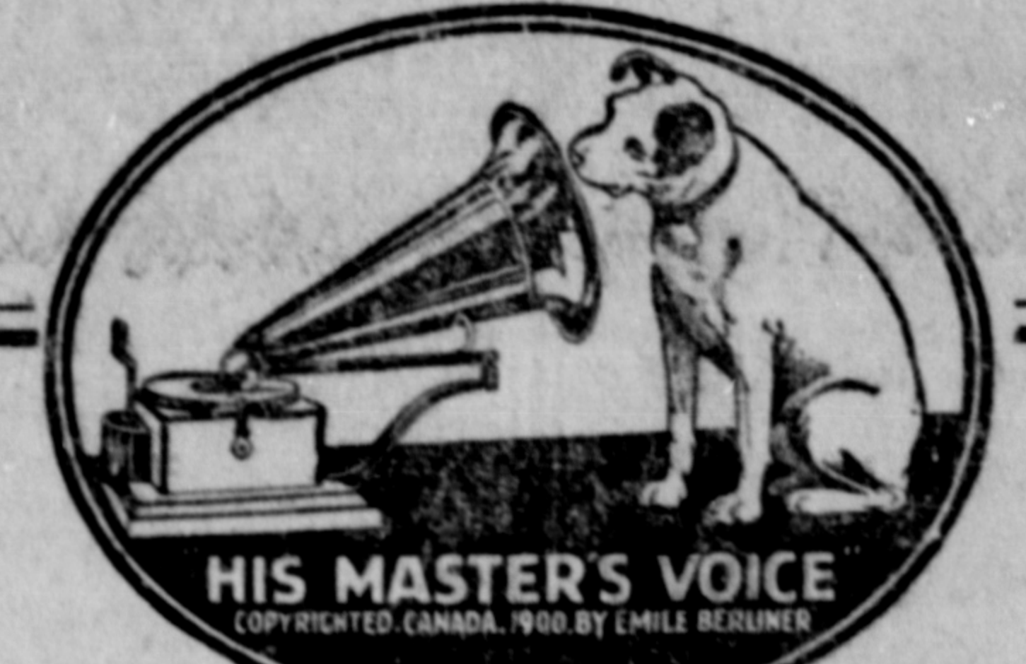
HIS MASTER'S VOICE