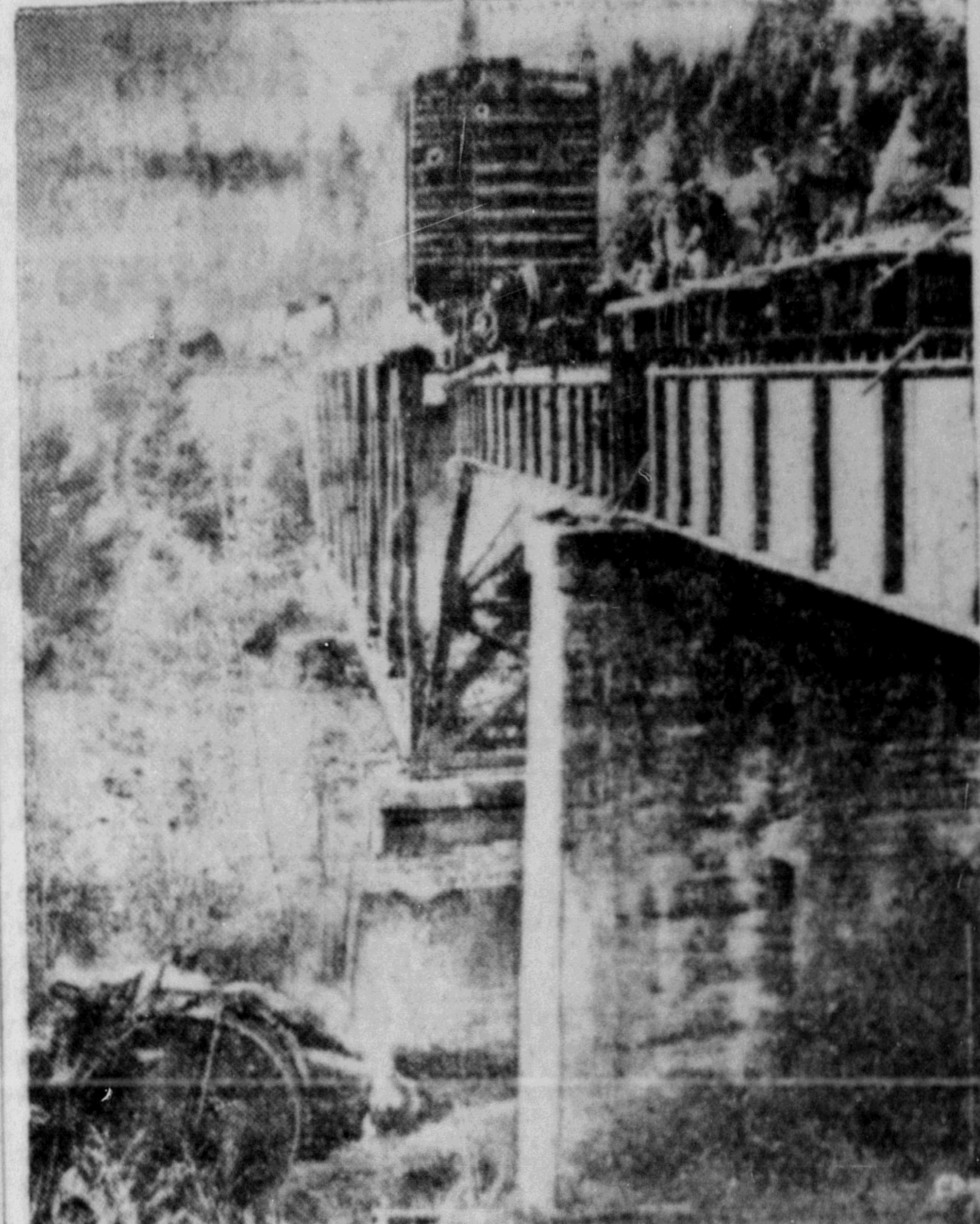
TANKER FALLS —A loaded tank car toppled from a Canadian Pacific Railway bridge into a gorge and burst into flames near Creston, B.C. Twelve cars were derailed in the wreck. Flames shot 60 feet in the air before the fire was extinguished.

"Despite the good harvest of albacore tuna in our waters," he went on, "American cannery, through our State Department, requested the Japanese government to raise the quota by 6,000 tons."