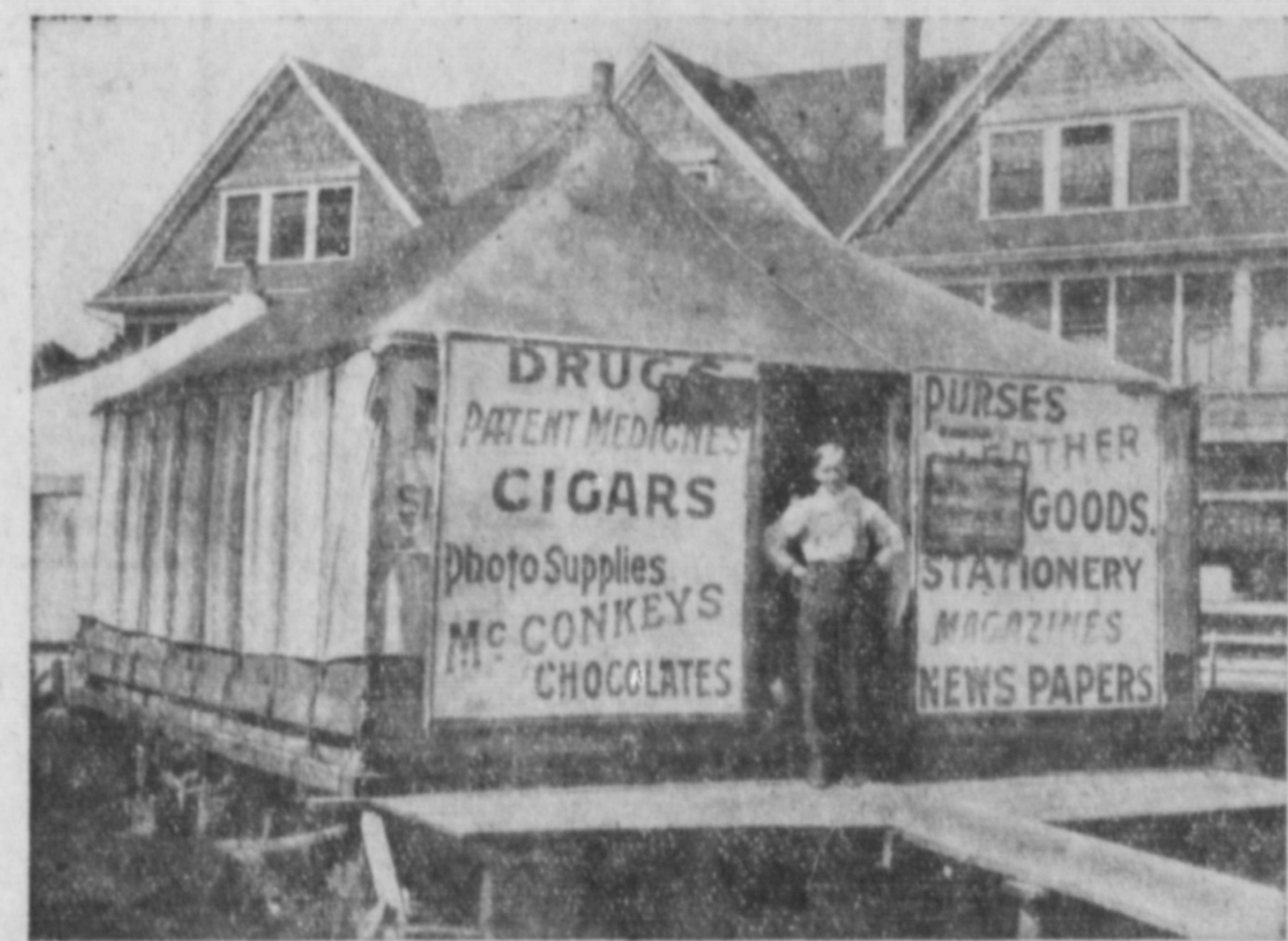
Prince Rupert's First Drug Store (1908)