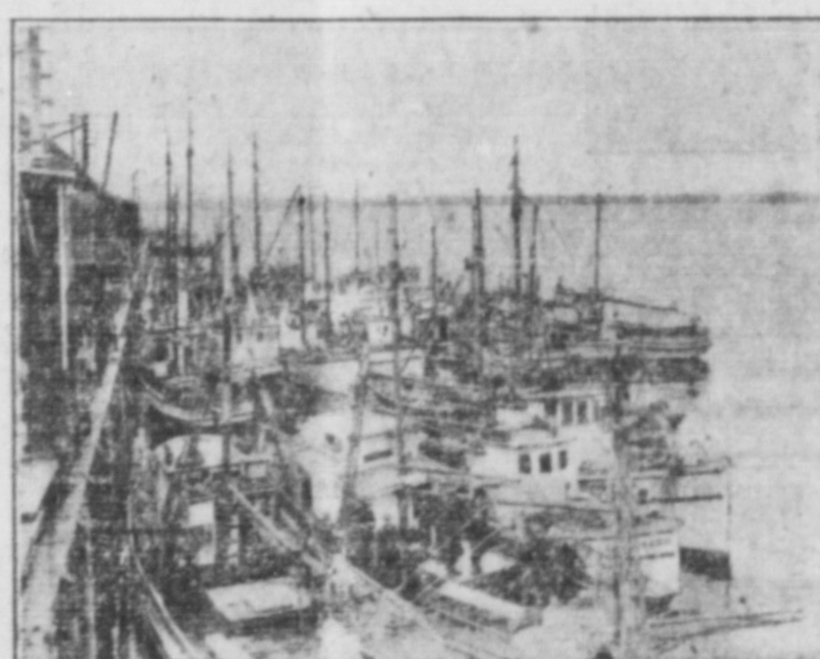
Part of Prince Rupert Fishing Fleet