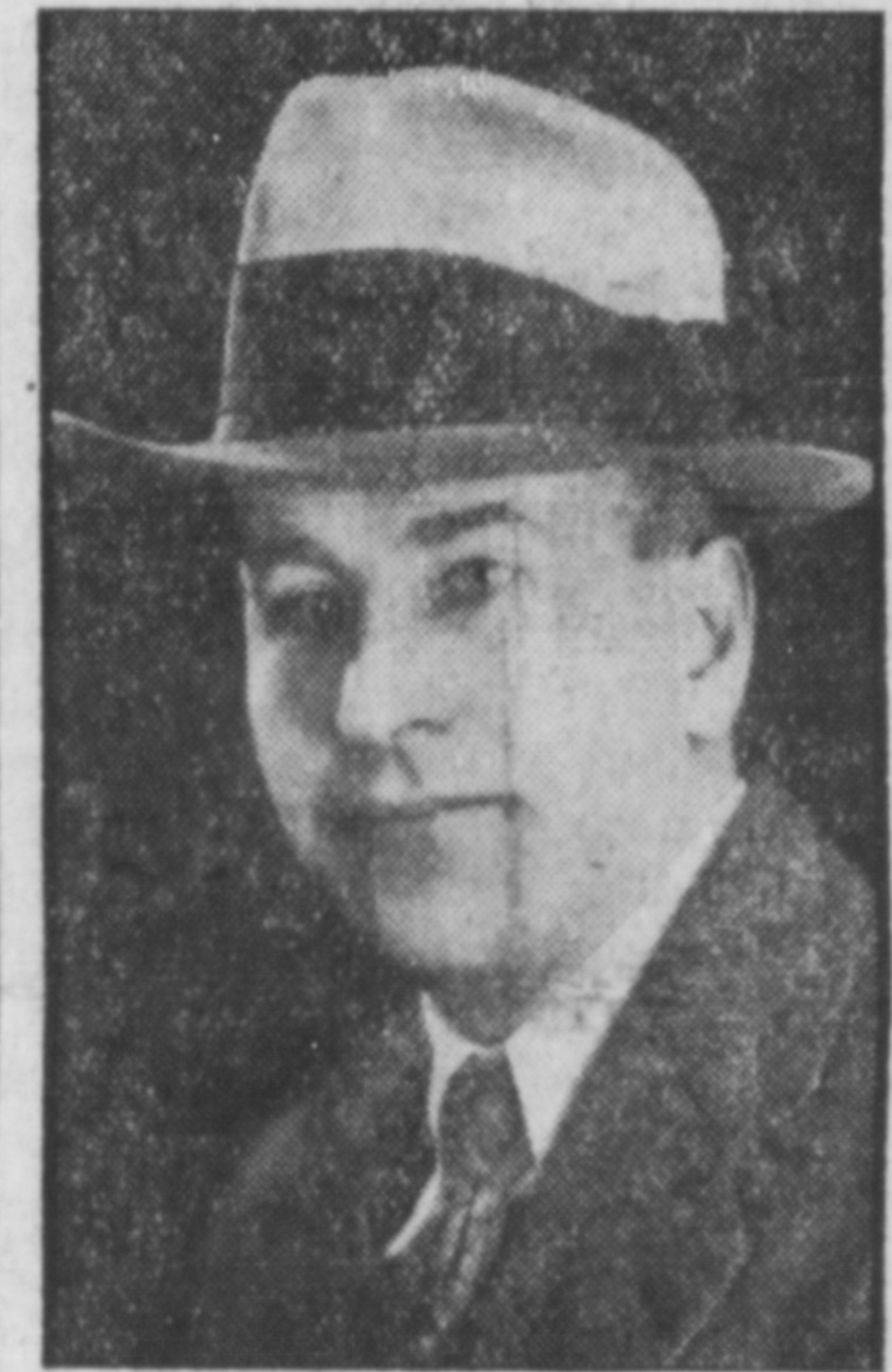
Who officially switched on new power yesterday.