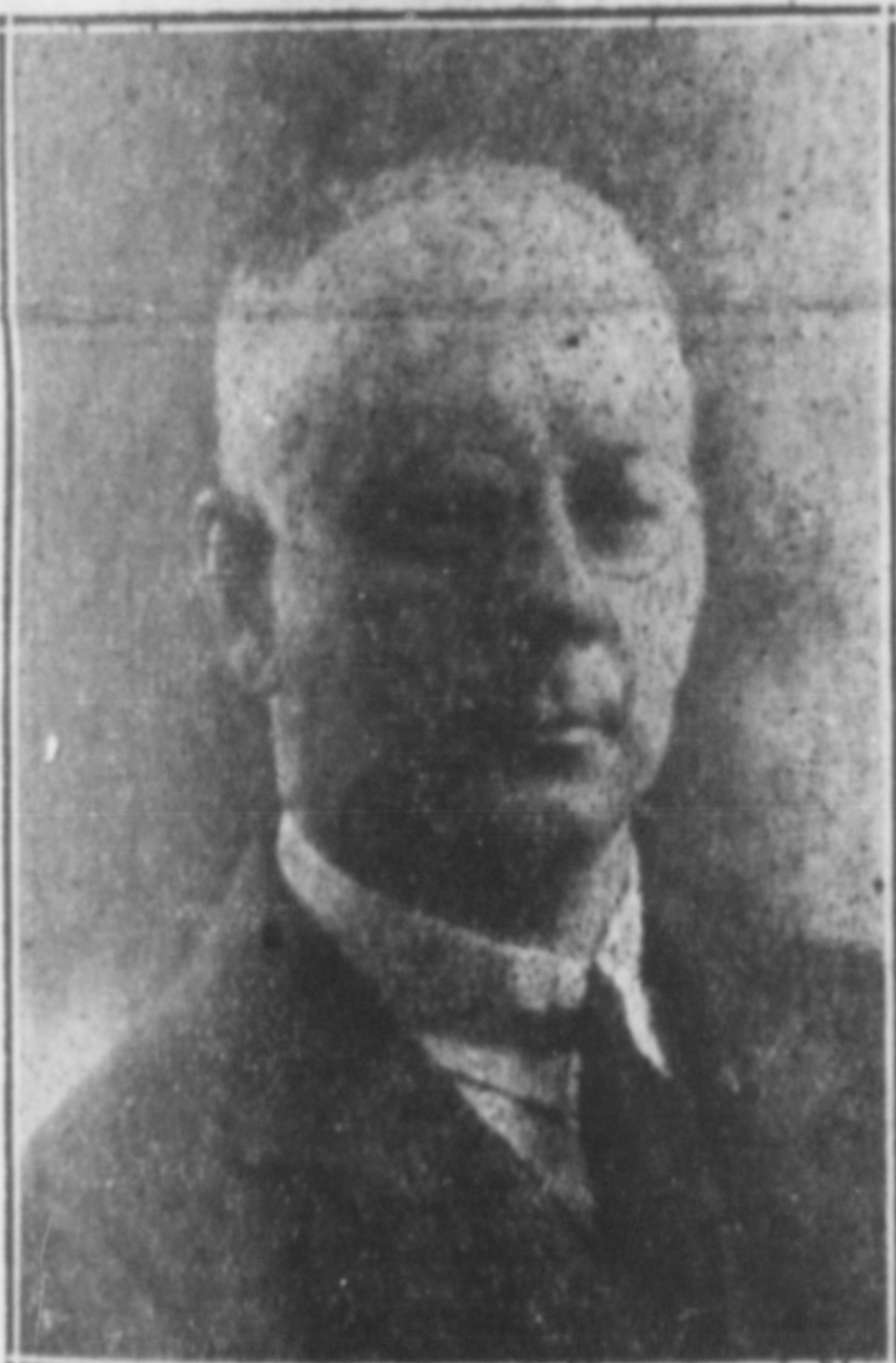
Assistant commercial manager of Power Corporation of Canada.