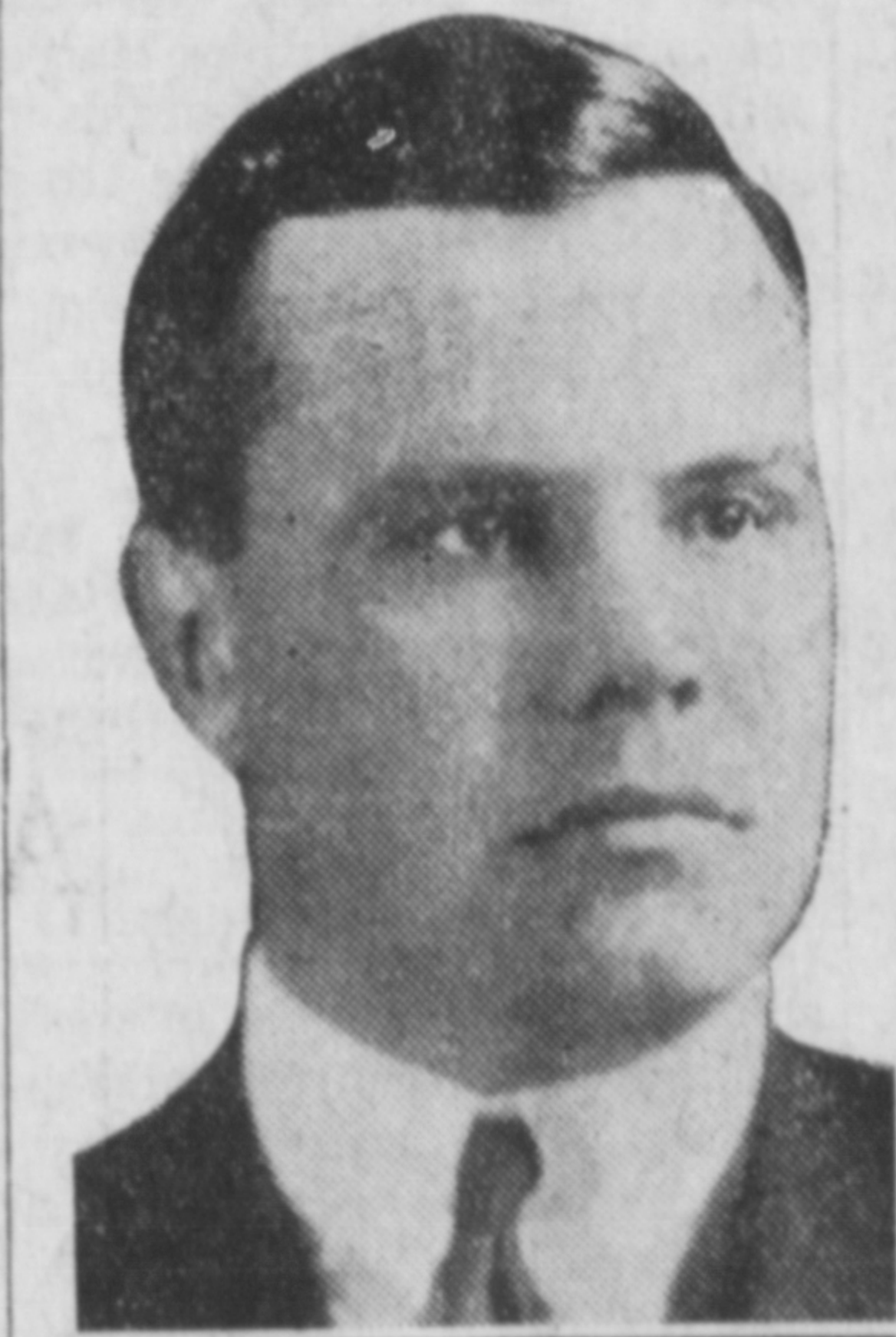
Vice-president Northern B. C. Power Co. Ltd.