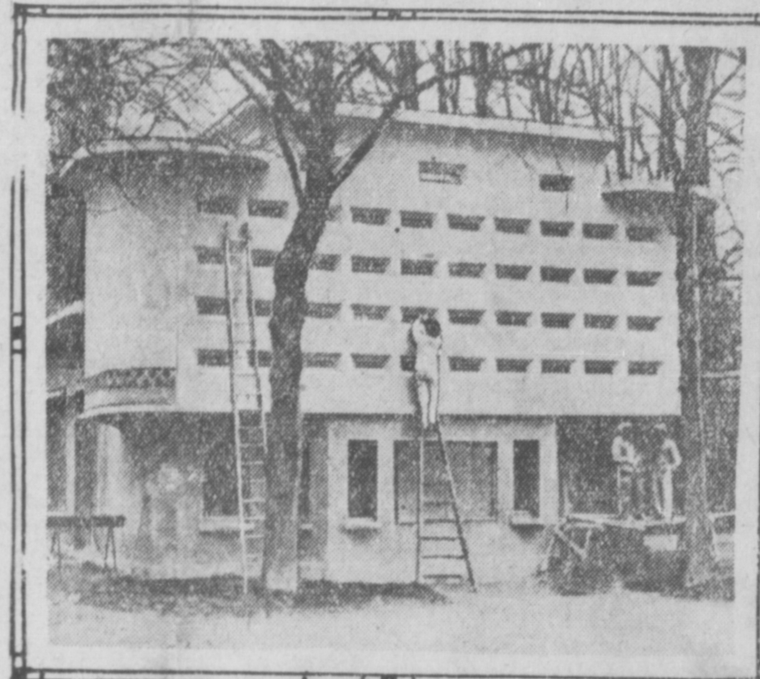
ELABORATE MACHINE: An exterior view of the new Totalisator, a betting machine being completed at the Longchamps race track for the coming season

EARTHQUAKE IN SOFIA SOFIA, April 19.—A violent earthquake shook Sofia at 9:25 last night and a general panic follows.