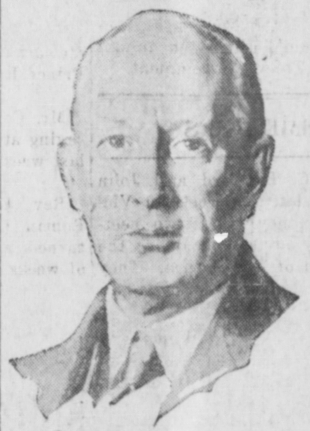
President of the Bank of Montreal