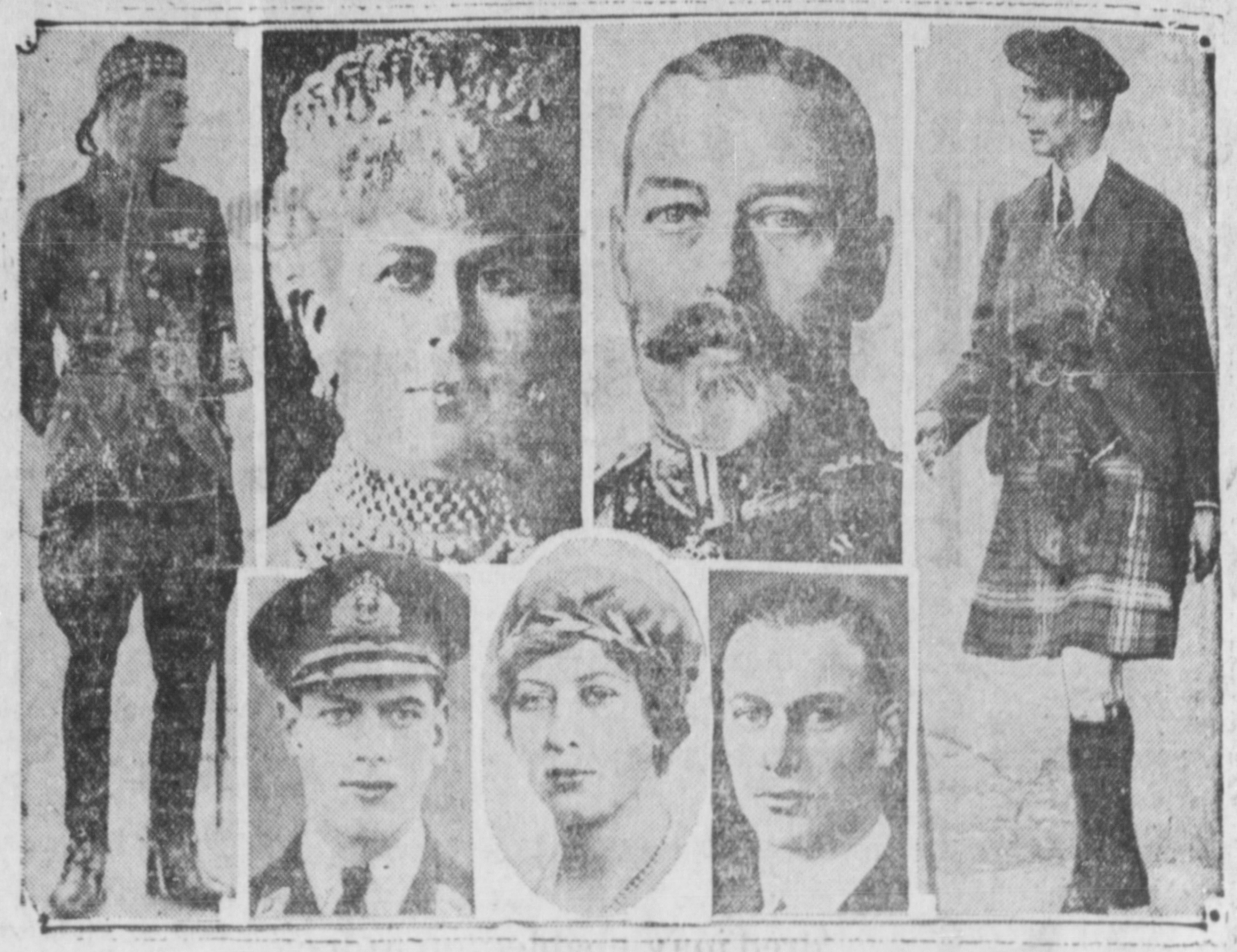
Left: The Prince of Wales. Top: Queen Mary and King George V. Right: The Duke of York. Below: Left to Right, Prince George, Princess Mary and Prince Henry, now known as the Duke of Gloucester.