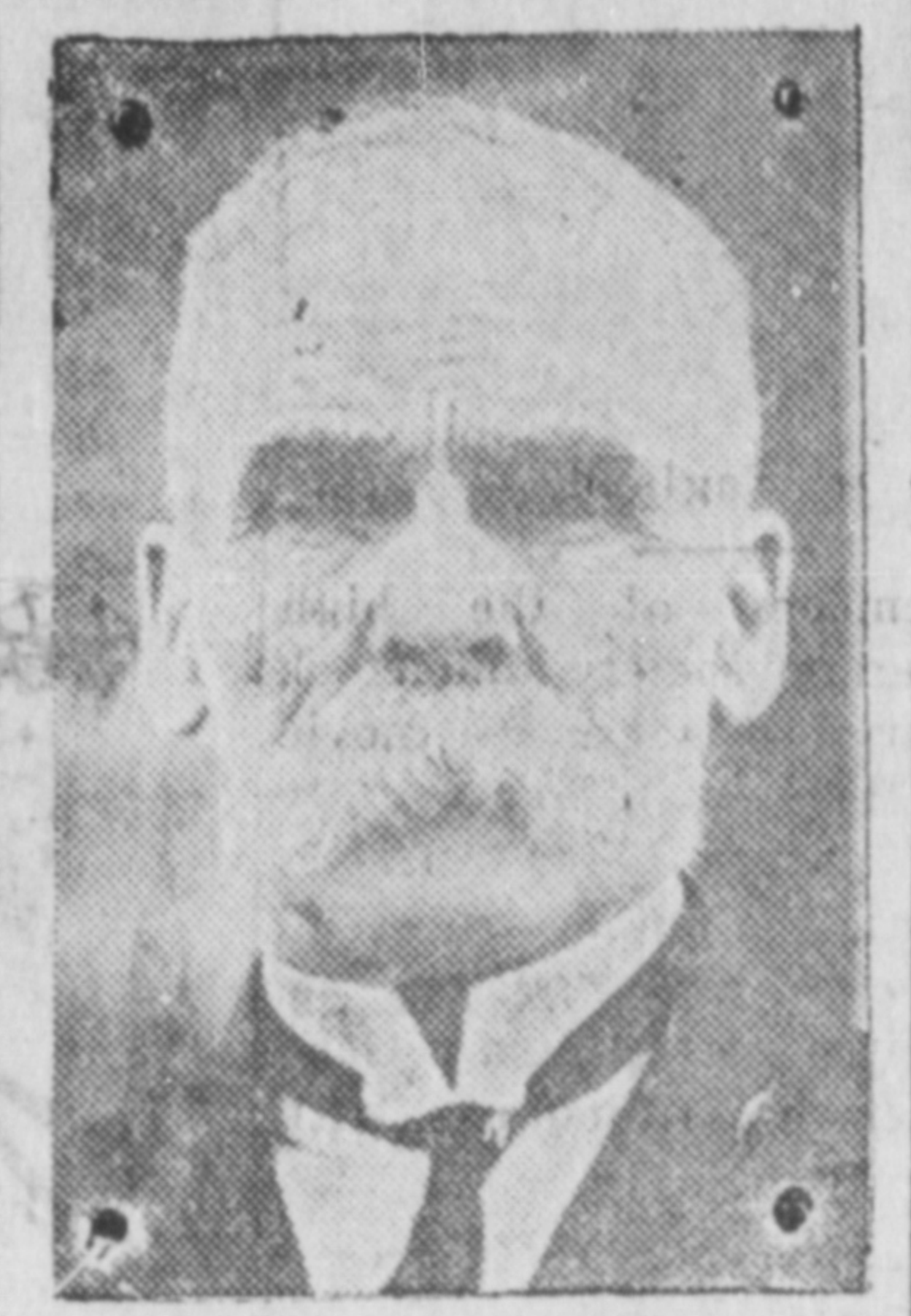
Hon. Frank Oliver, whose name, with two others, is mentioned in connection with the vacancy on the Dominion Tariff Board.