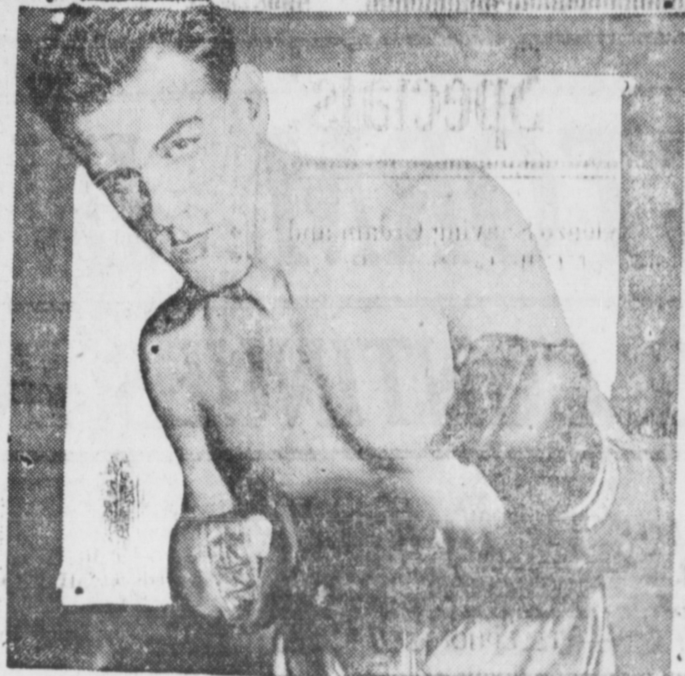
NORWEGIAN HEAVYWEIGHT CONTENDER