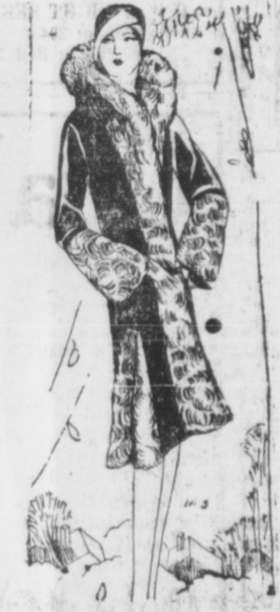
Winter Coats Are Elaborately Fur Trimmed

Winter coats for dress wear tend to be more elaborate both in cut and material than they have been for many a season.