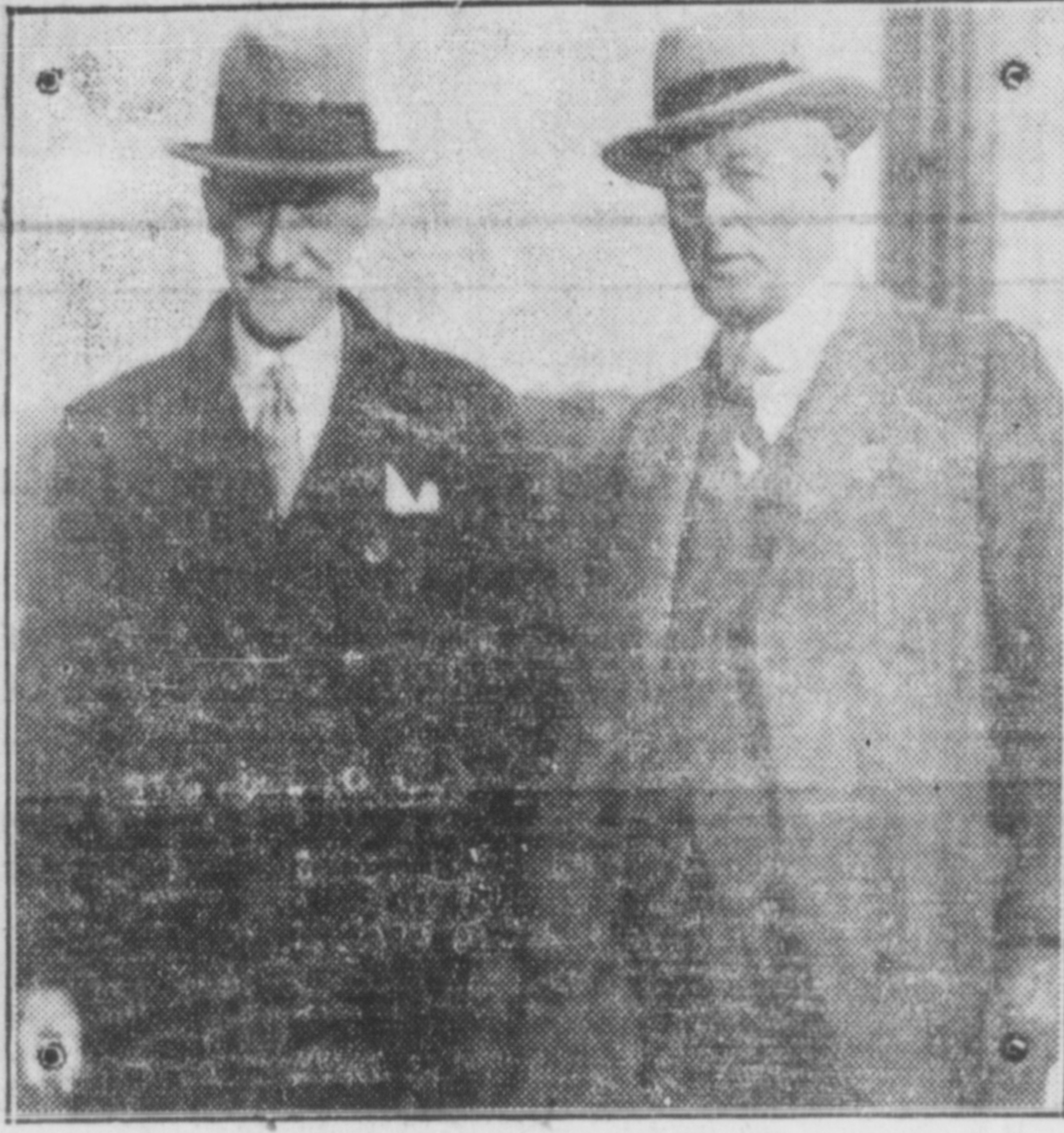
His Excellency the Governor-General of Canada, on the left, with Hon. Dr. J. M. Baxter, Premier of New Brunswick, inspecting the hydro electric power development at Grand Falls on the Saint John River, New Brunswick, just after Lord Willingdon turned on the power of the biggest hydro plant in the Maritime Provinces. The construction of this plant has just been completed with an initial installation of 60,000 h.p. by the Saint John River Power Company.