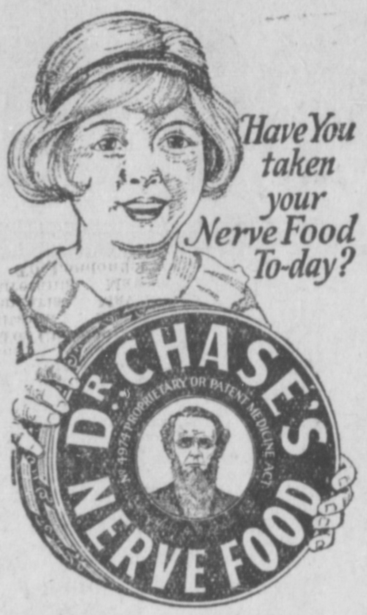
Have You taken your Nerve Food To-day? DR. CHASE'S NERVE FOOD

fish interpretation of the word, that is to say, on horseback, and steeplechasing are forms of sport almost as hazardous, it would appear, as aviation. The participant, although he cannot fall so far as the luckless air pilot, does so more often and under circumstances that are by no means reassuring in the matter of life and limb.