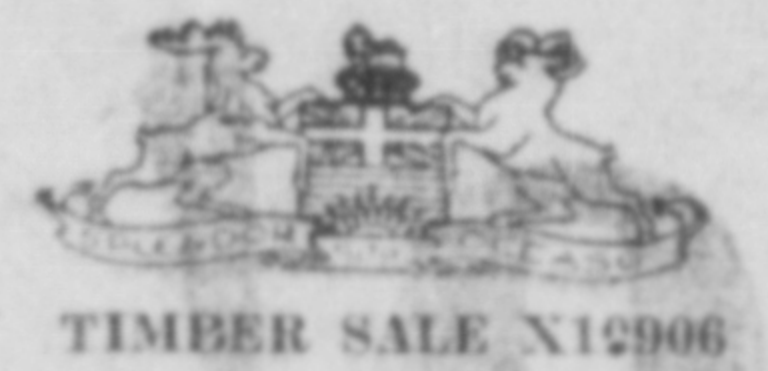
TIMBER SALE X10906

We have moved our office and showroom to 319 Third Avenue, where we have everything in sheet metal pipe fittings and furnaces. Phone 340. Box 467. 319 Third Avenue