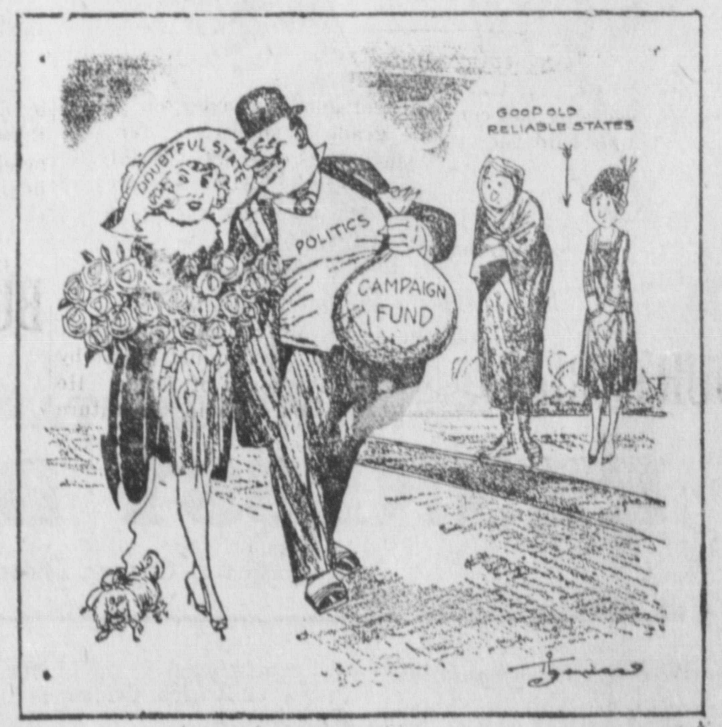
THE FICKLE AND THE FAITHFUL