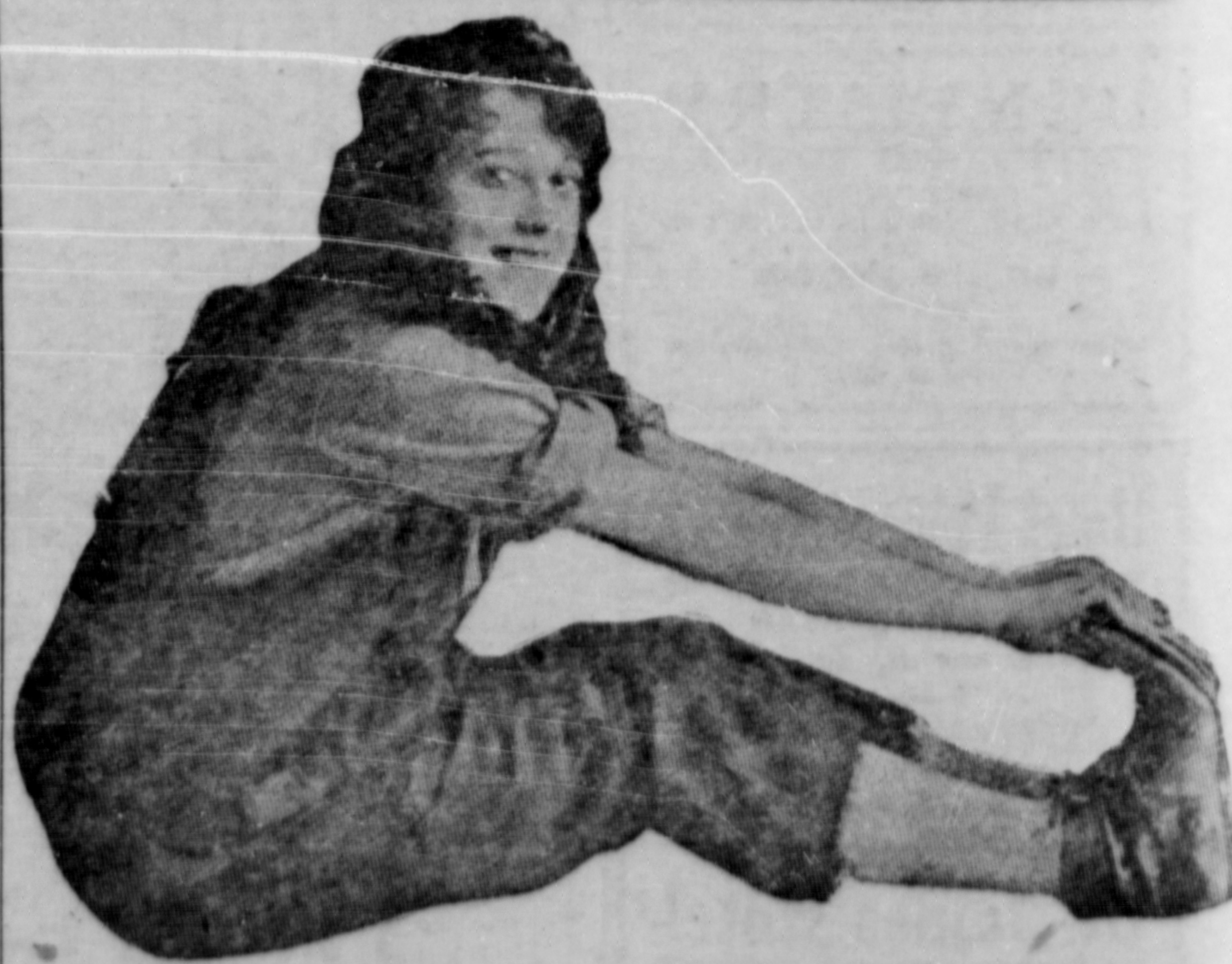
MABEL NORMAND as "Mickey," who will be seen at the Empress Theatre tomorrow, Friday and Saturday with Saturday matinee.