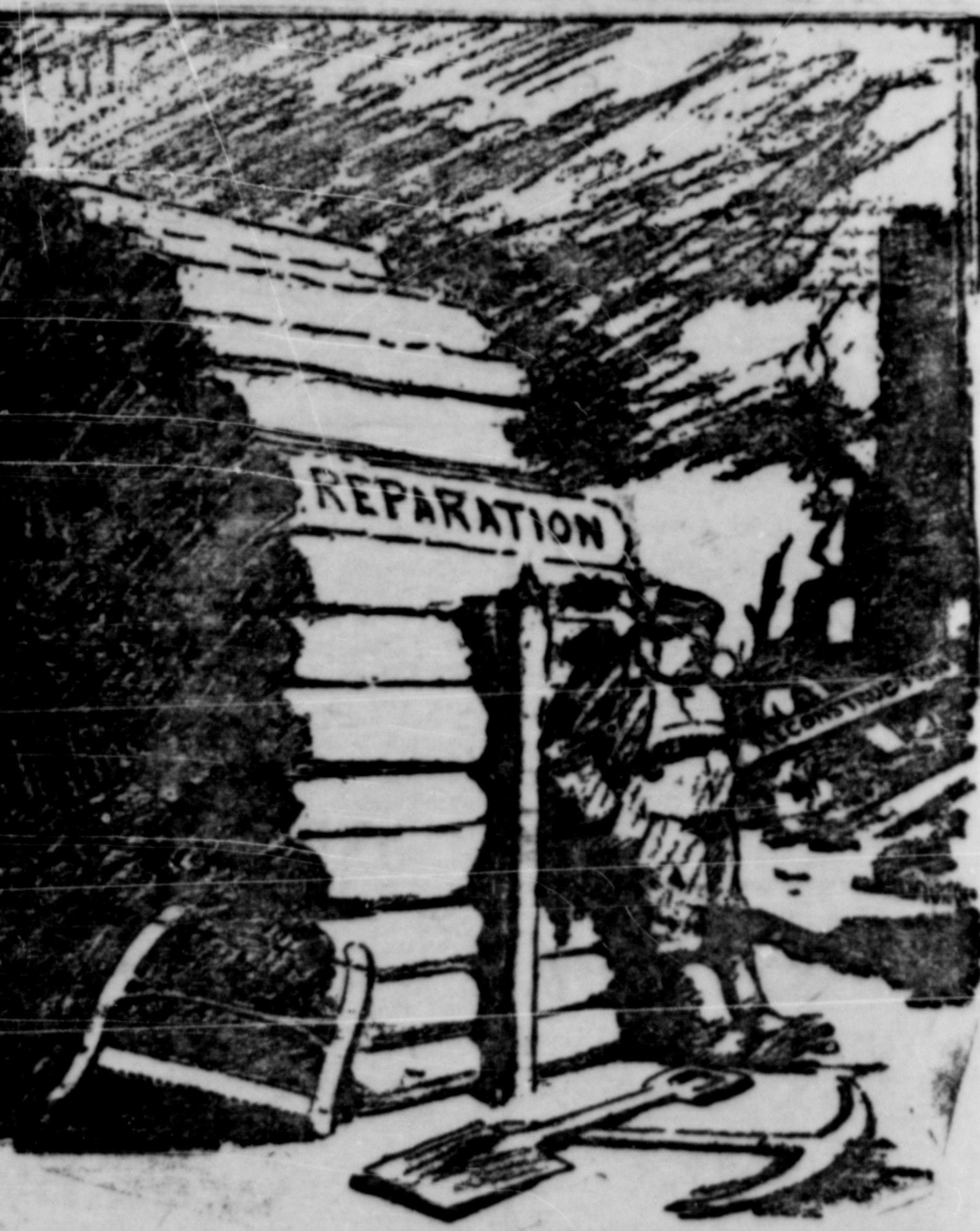
Work or Fight