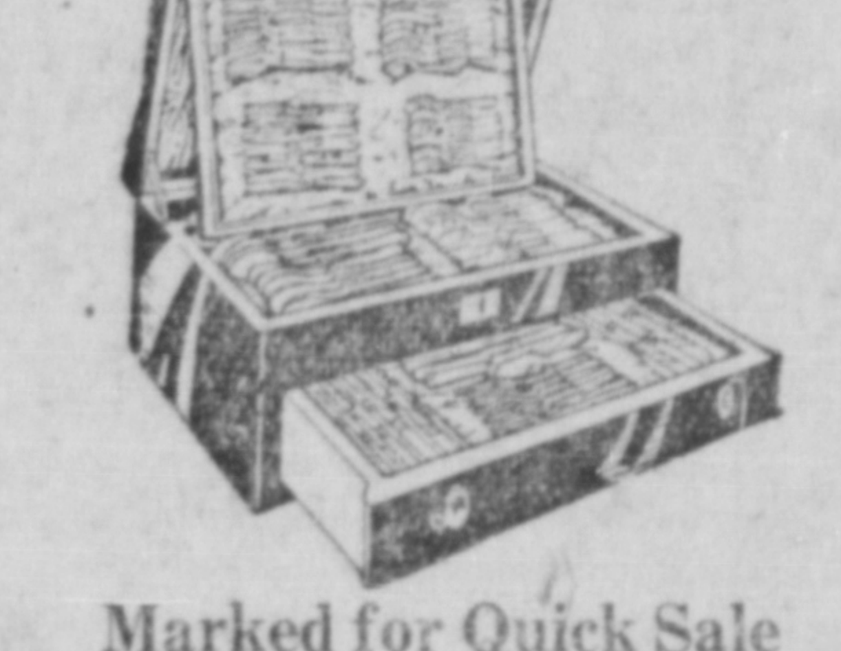
Marked for Quick Sale

TOO GOOD TO LAST Beautiful Painted China Ceramic Dishes and Spoon Tray. Only a limited number. All imported China-ware of beautiful design and shapes. Regular $2.00 sellers. While they last, Each 65c