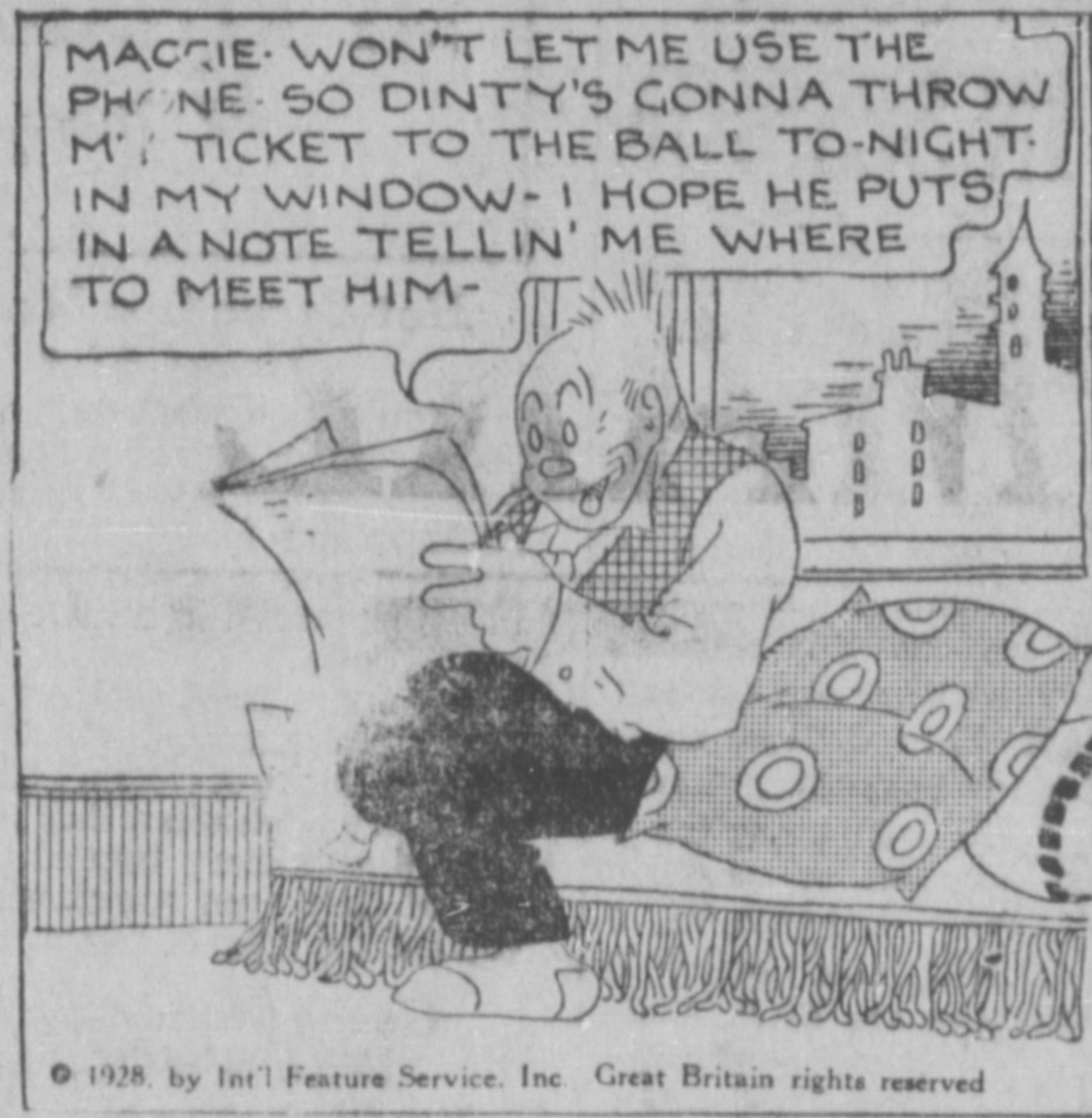
© 1928 by In-T Feature Service, Inc. Great Britain rights reserved