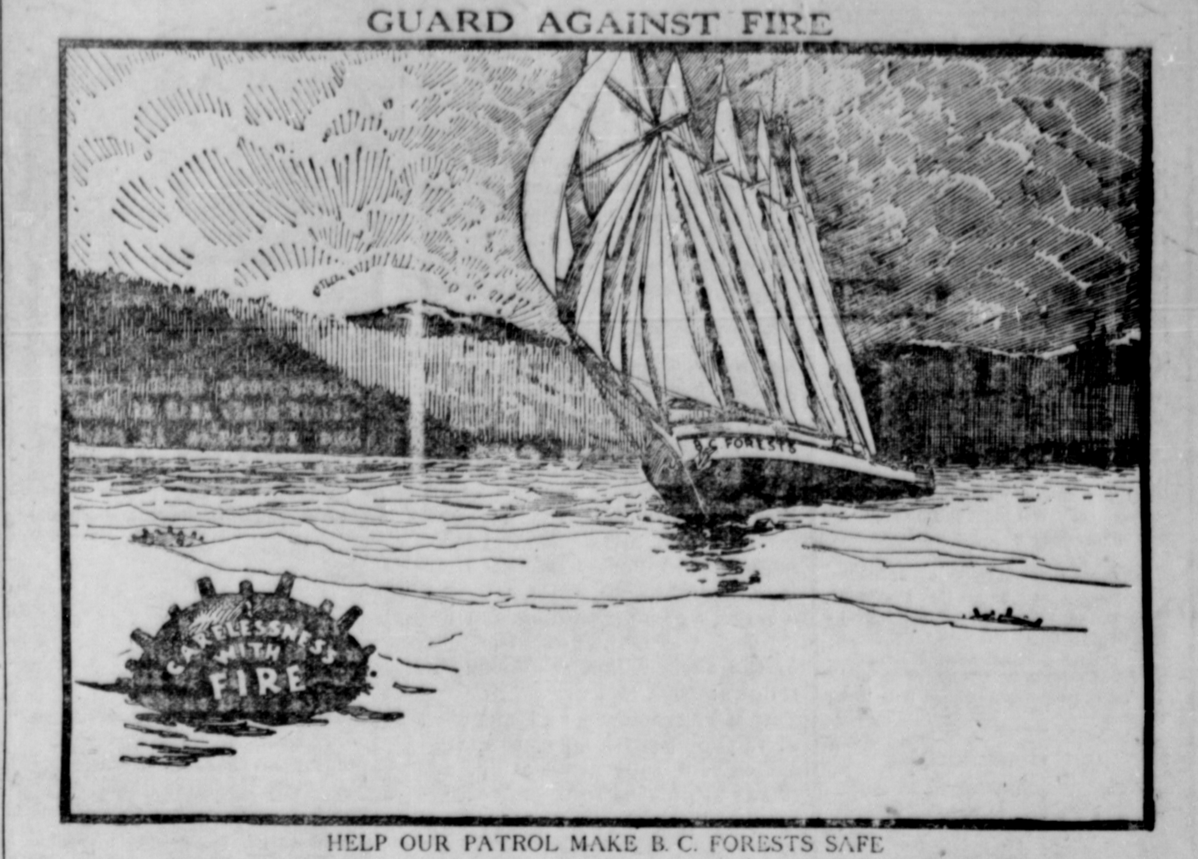
HELP OUR PATROL MAKE B. C. FORESTS SAFE