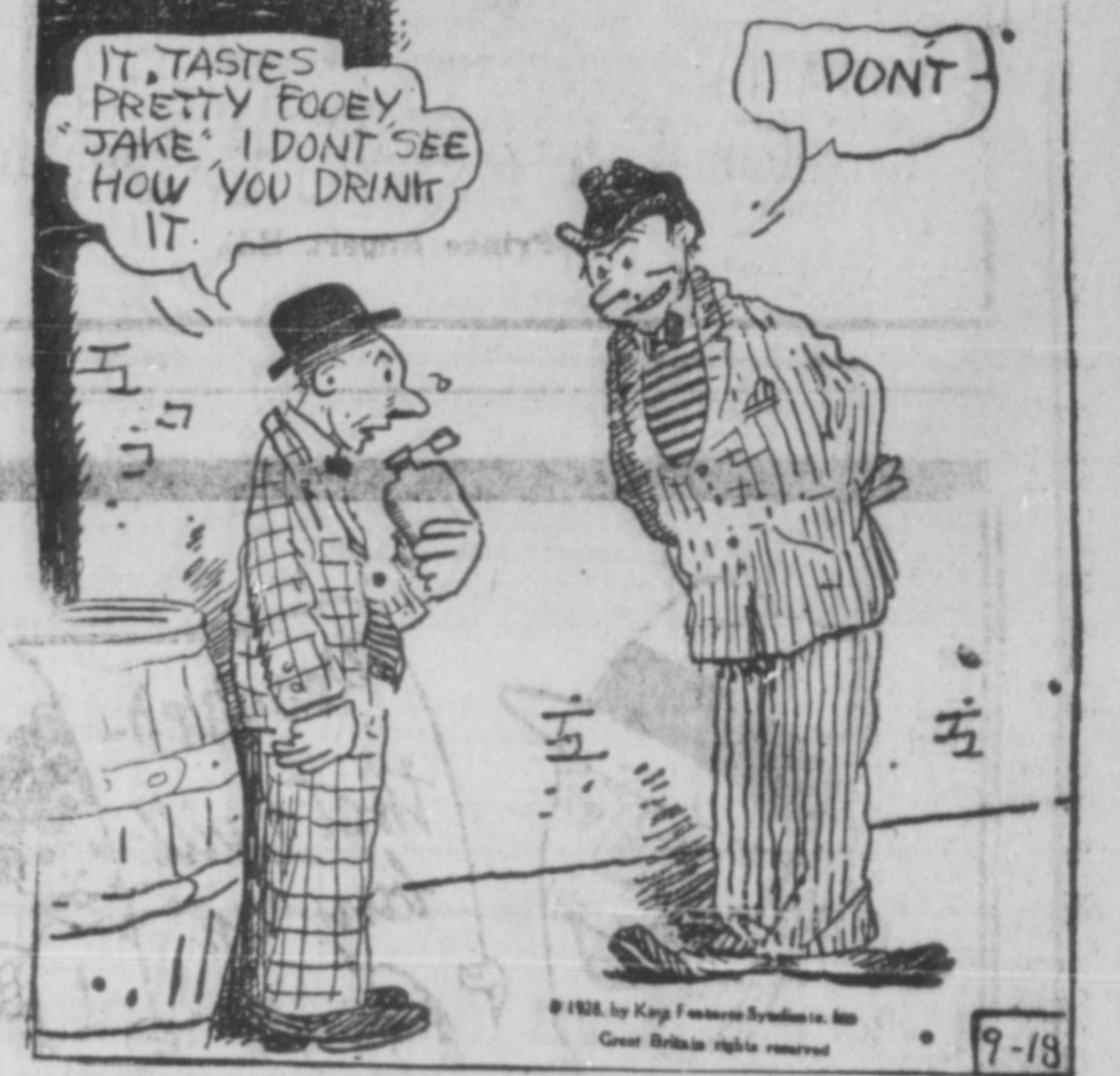
King Features Syndicate, Inc. Great Britain rights reserved. 9-18