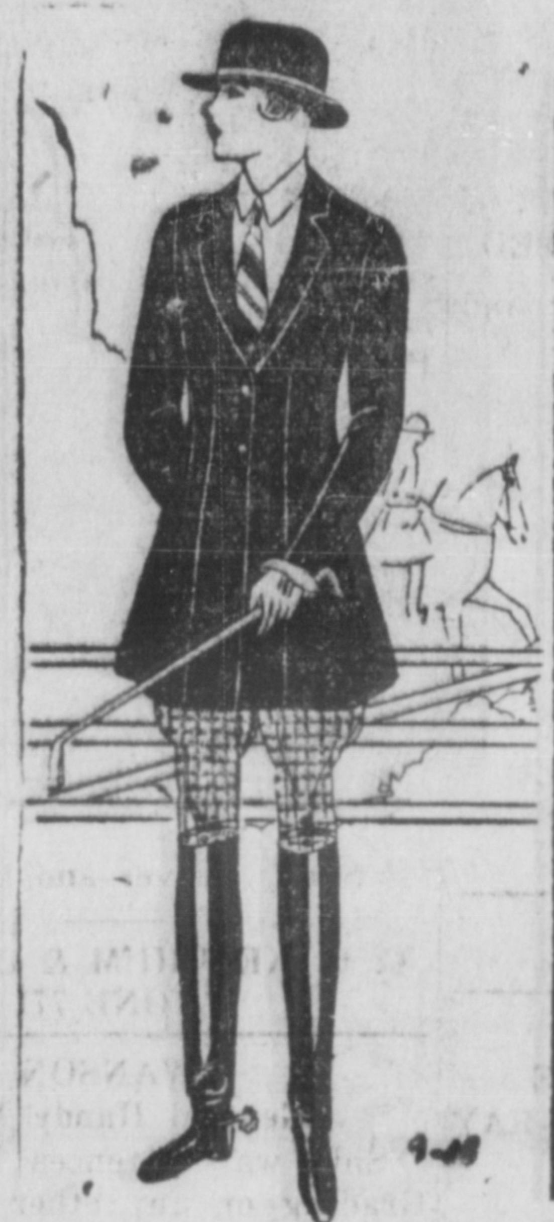
A Riding Habit as Smart as It Is Correct

There is something in the knowledge that you are correctly clad that insures your peace of mind when you are riding. And were you the fortunate possessor of this extremely smart habit you would be assured of being well dressed.