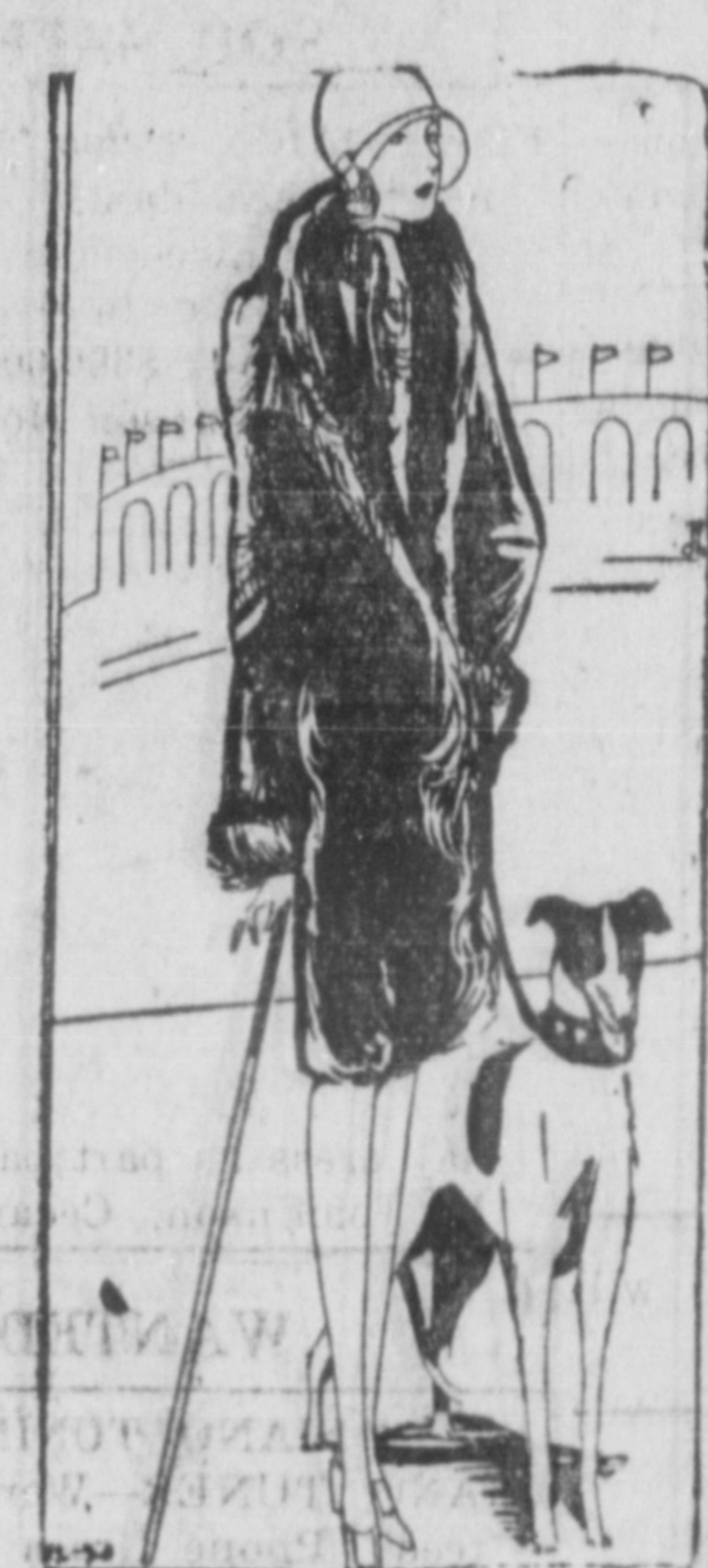
THE LITTLE FUR CRAVAT TAKES ANOTHER BOW

An innovation of this season of novations is the little cravat of fur worn with afternoon coats. The idea is as practical as it is smart, for the cravat is wrapped, lock-fashion, around the throat to keep winter winds away.