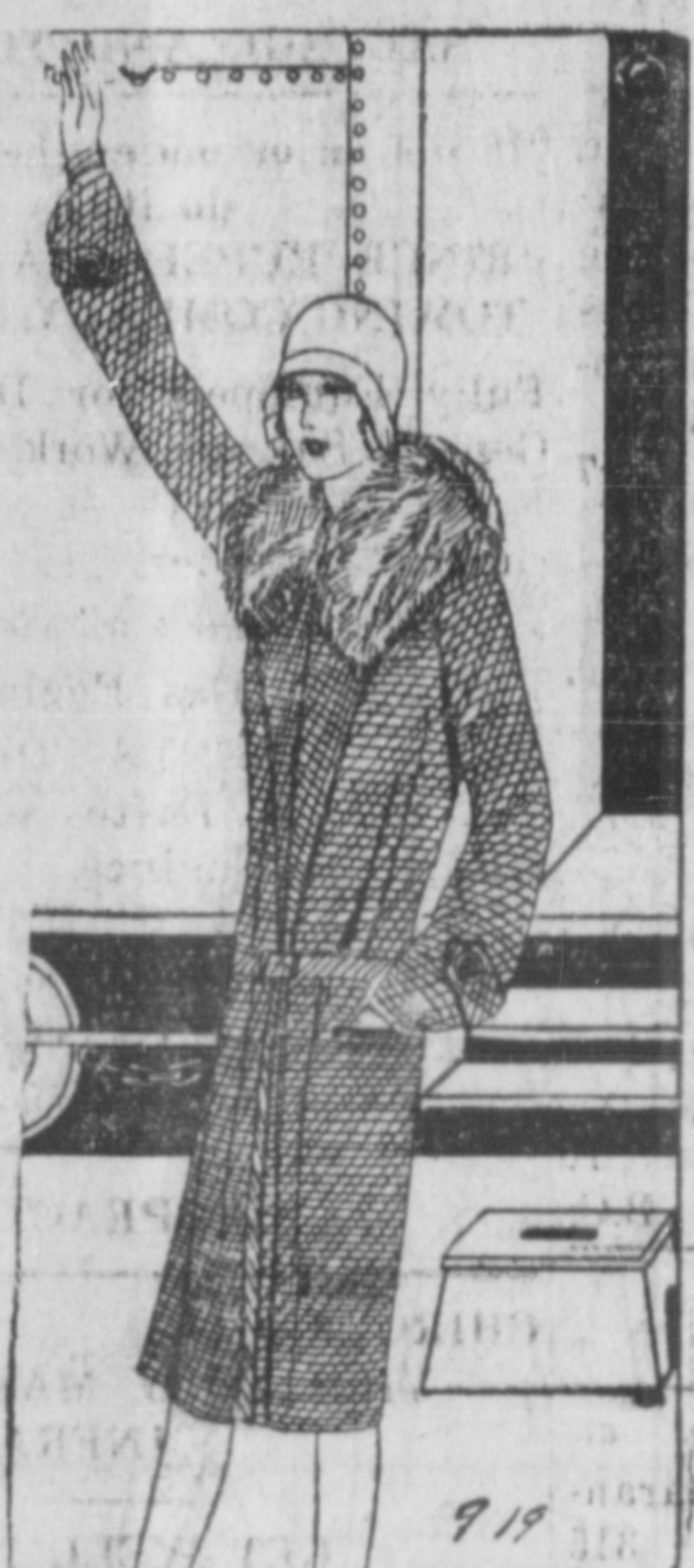
This Tweed Coat is Practical for the College Girl

What were last year, dubbed "travel coats" are still practical and smart this year. And may still be called by the same name.