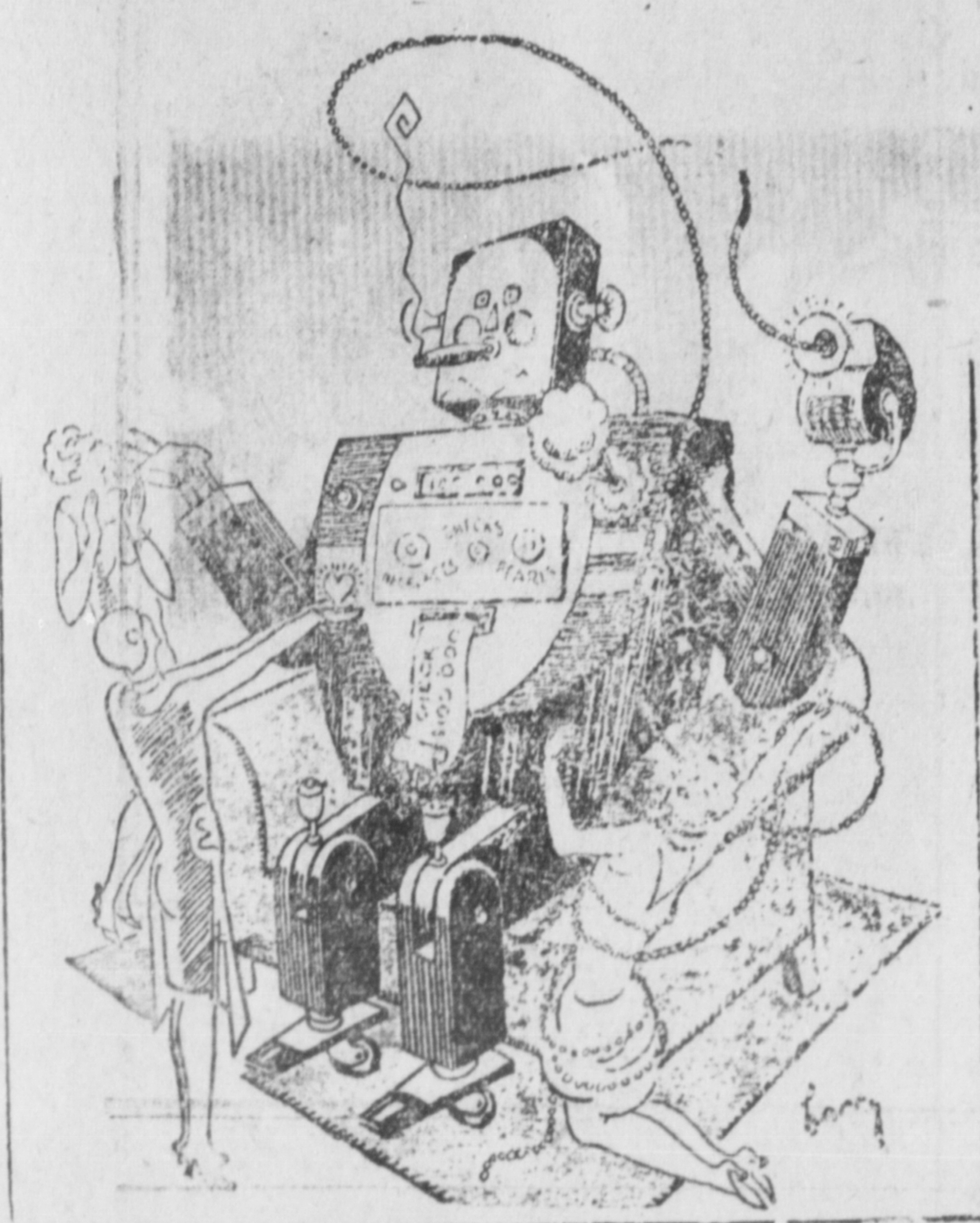
THE AUTOMATIC HUSBAND OF THE FUTURE —Le Rire, Paris.