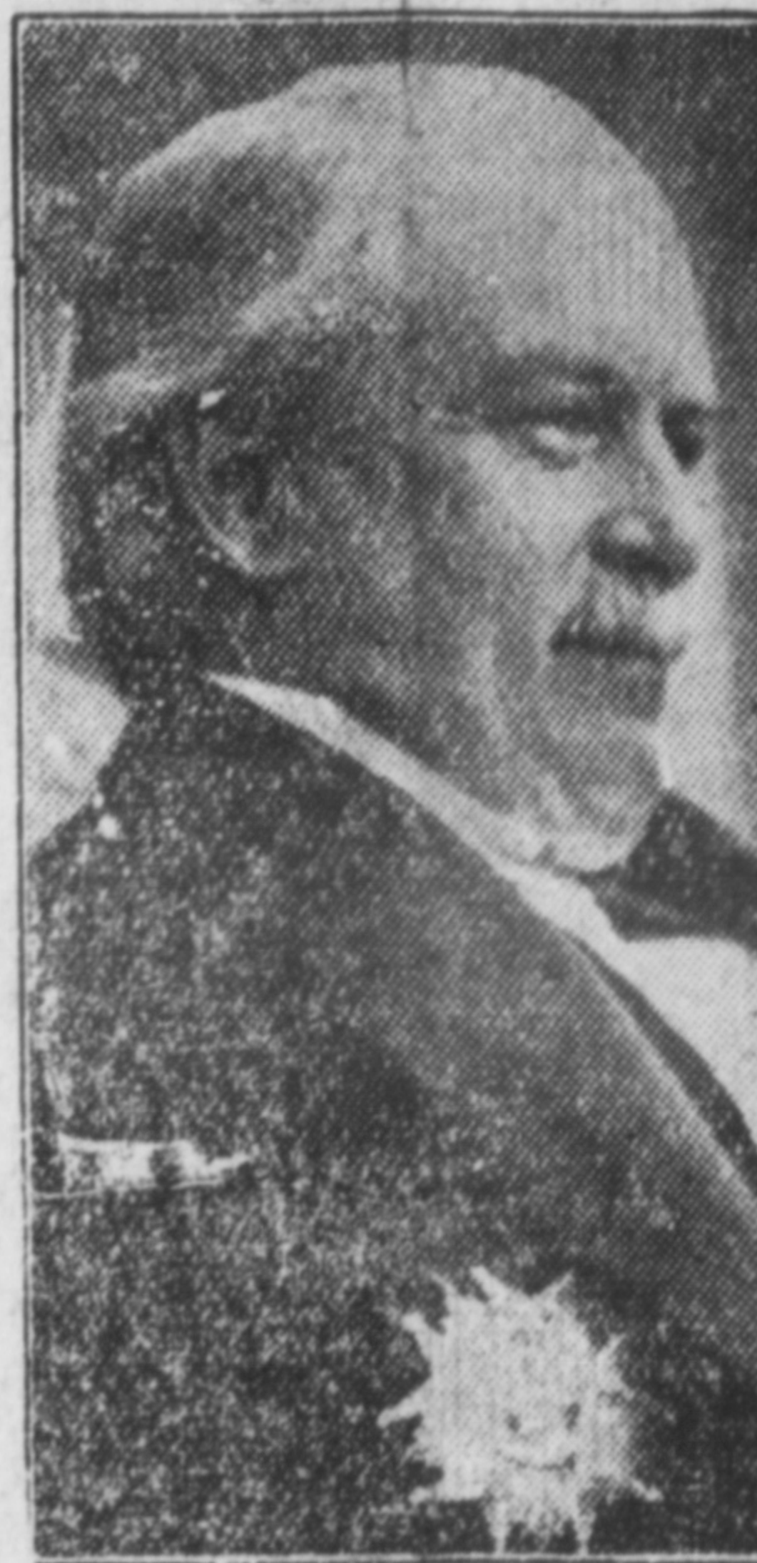
RT. HON. D. LLOYD GEORGE