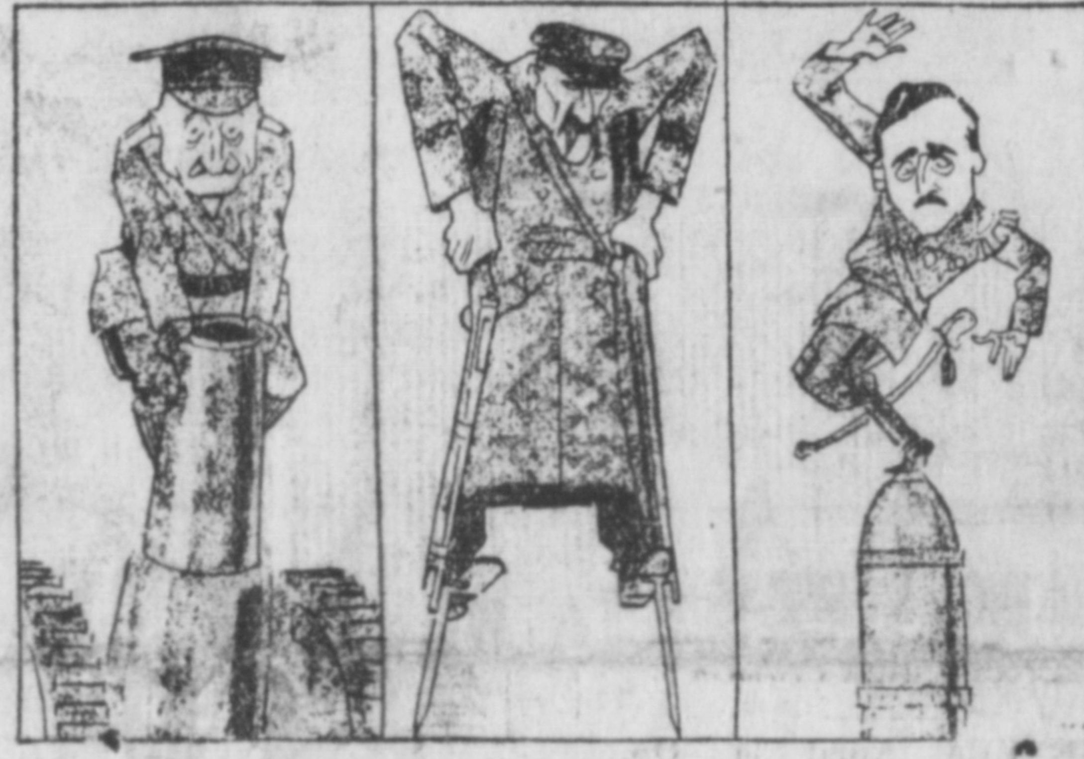
PRIMO DE RIVERA PILSUDSKI ALEXANDER

DICTATORS — From Kladderadatsch, Berlin.