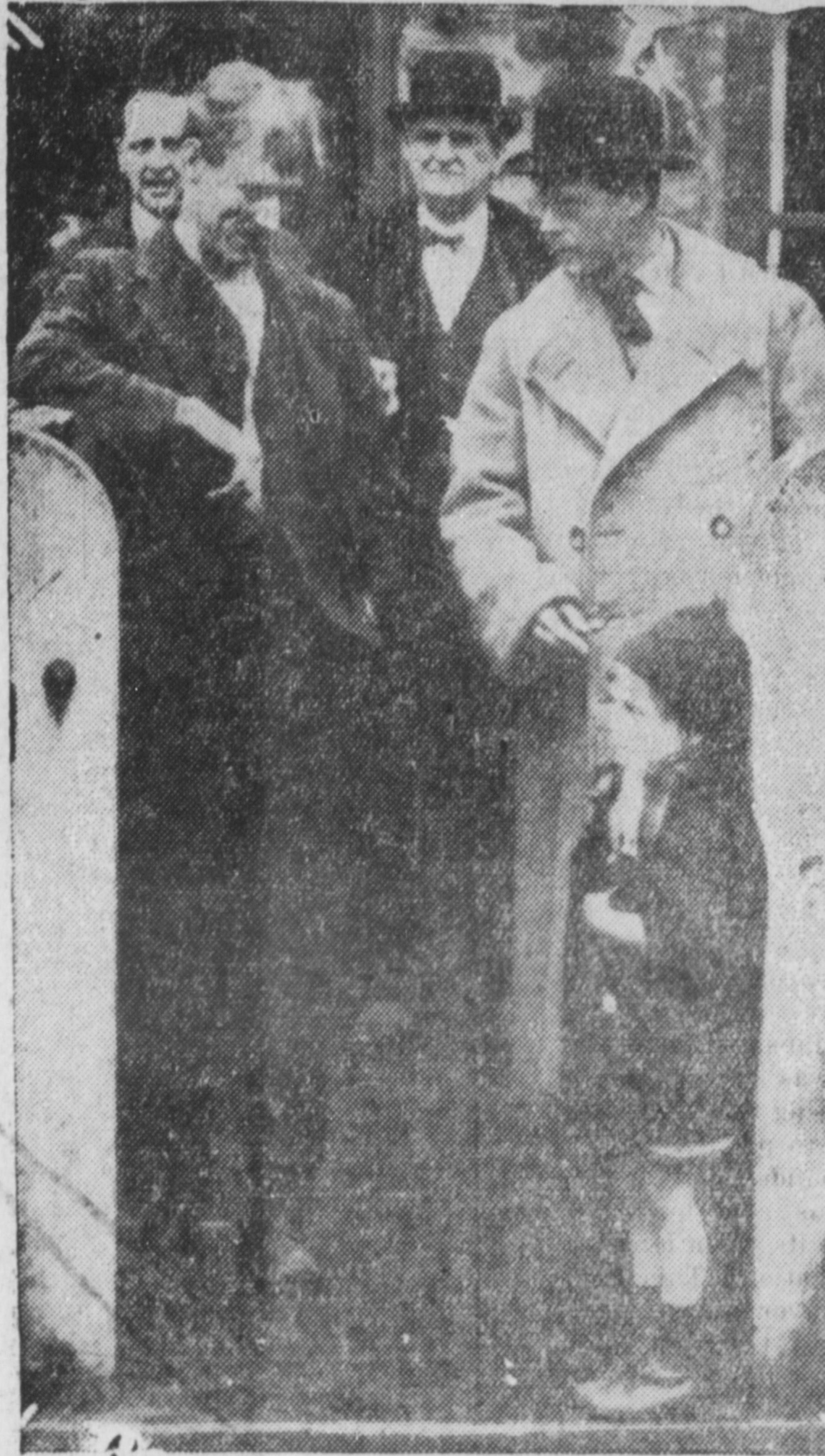
The above photograph shows the Prince of Wales chatting with an unemployed miner at the gate of his home at Nuttas House, Birchester Moore, one of the hardest hit of the mining districts in the Old Country, where the homes of the unemployed are little more than hovels.