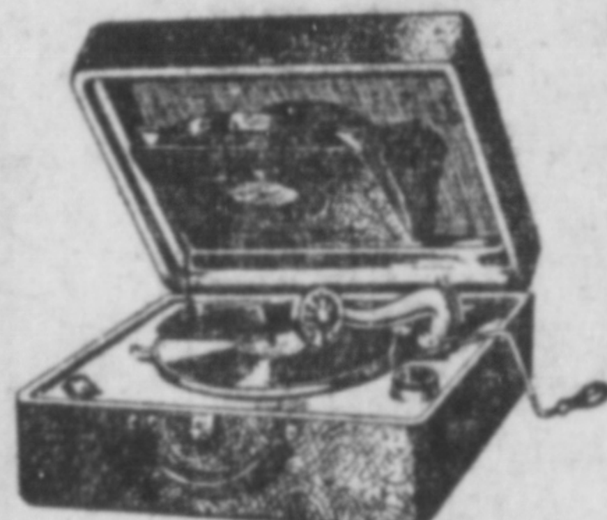
VICTOR PORTABLES $35 and $48.50