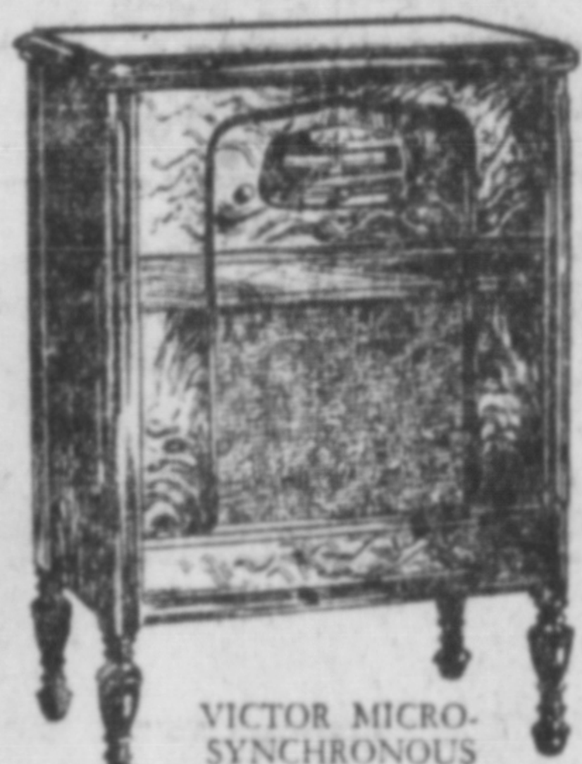
VICTOR MICRO-SYNCHRONOUS RADIO "Unrivalled at any price" Complete $255