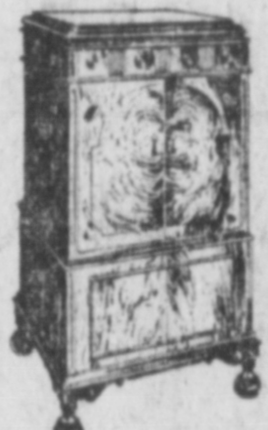
ORTHOPHONIC VICTROLA No. 4-70 $165

A VICTOR gift ranges from 75 cents for a Victor Record to $515 for the very finest de-luxe model Combination Radio-Electrola. In between . . . a wealth of choice! Victor Red Seal Records by distinguished stars begin at $1.00 . . . a collection can be made up at various prices . . . Victor portables at $35 . . . Orthophonics at $95 . . . Victor Micro-Synchronous Radio at $255—combined with Electrola to make the wonder-instrument of the age—at $375. Musical Masterpieces by world-famous Symphony Orchestras, complete in albums—with descriptive matter, some with spoken explanations by Leopold Stokowski, dean of great orchestra conductors, priced from $5.00.