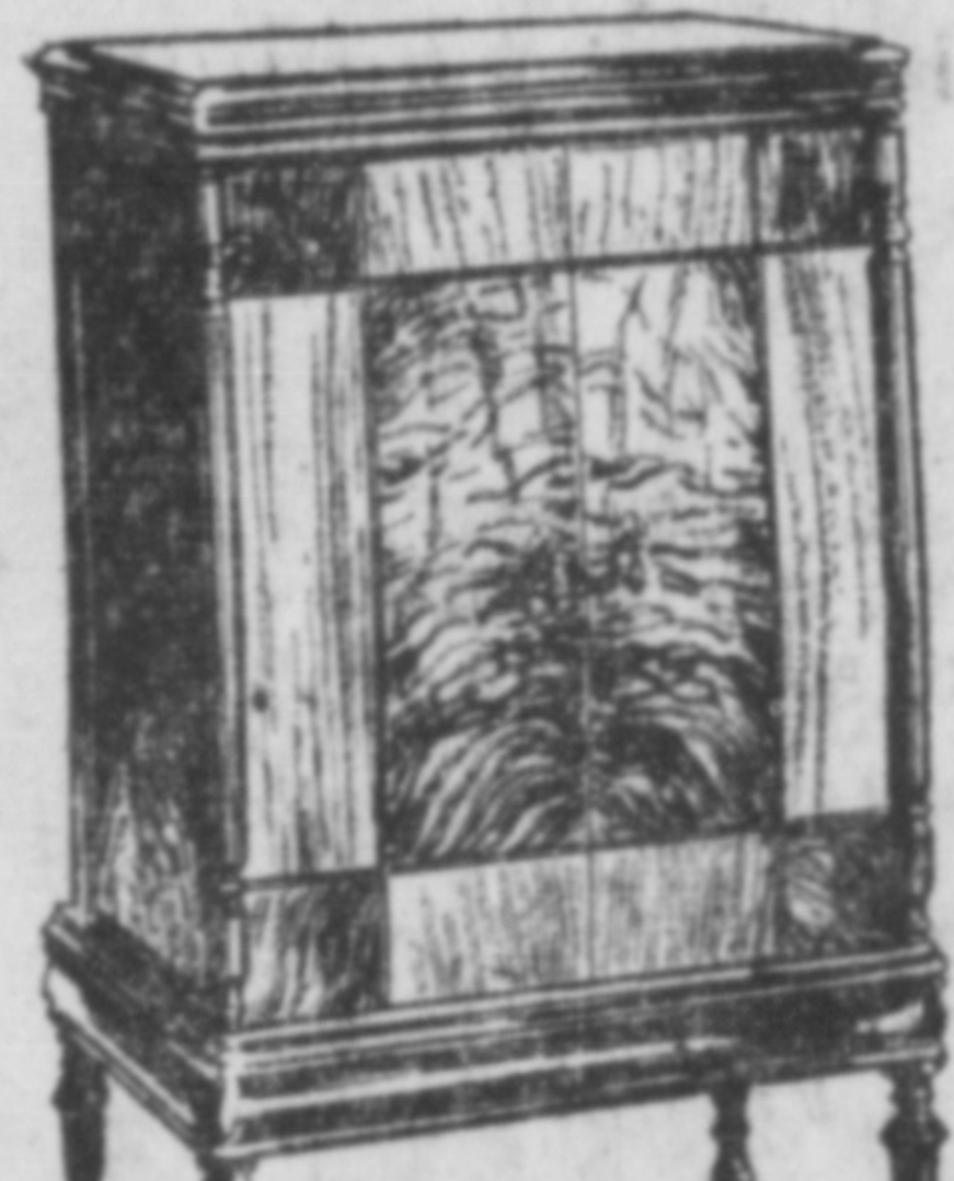
COMBINATION RADIO-ELECTROLA RE-45—Complete $375