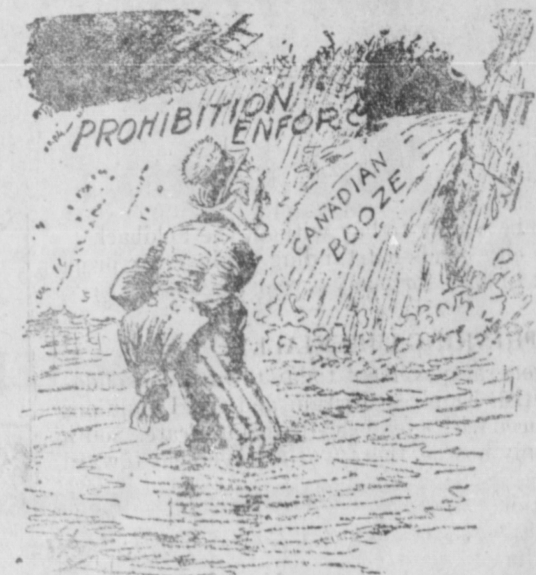
—Sykes in the Philadelphia Evening Public Record. EMBARRASSING MOMENTS