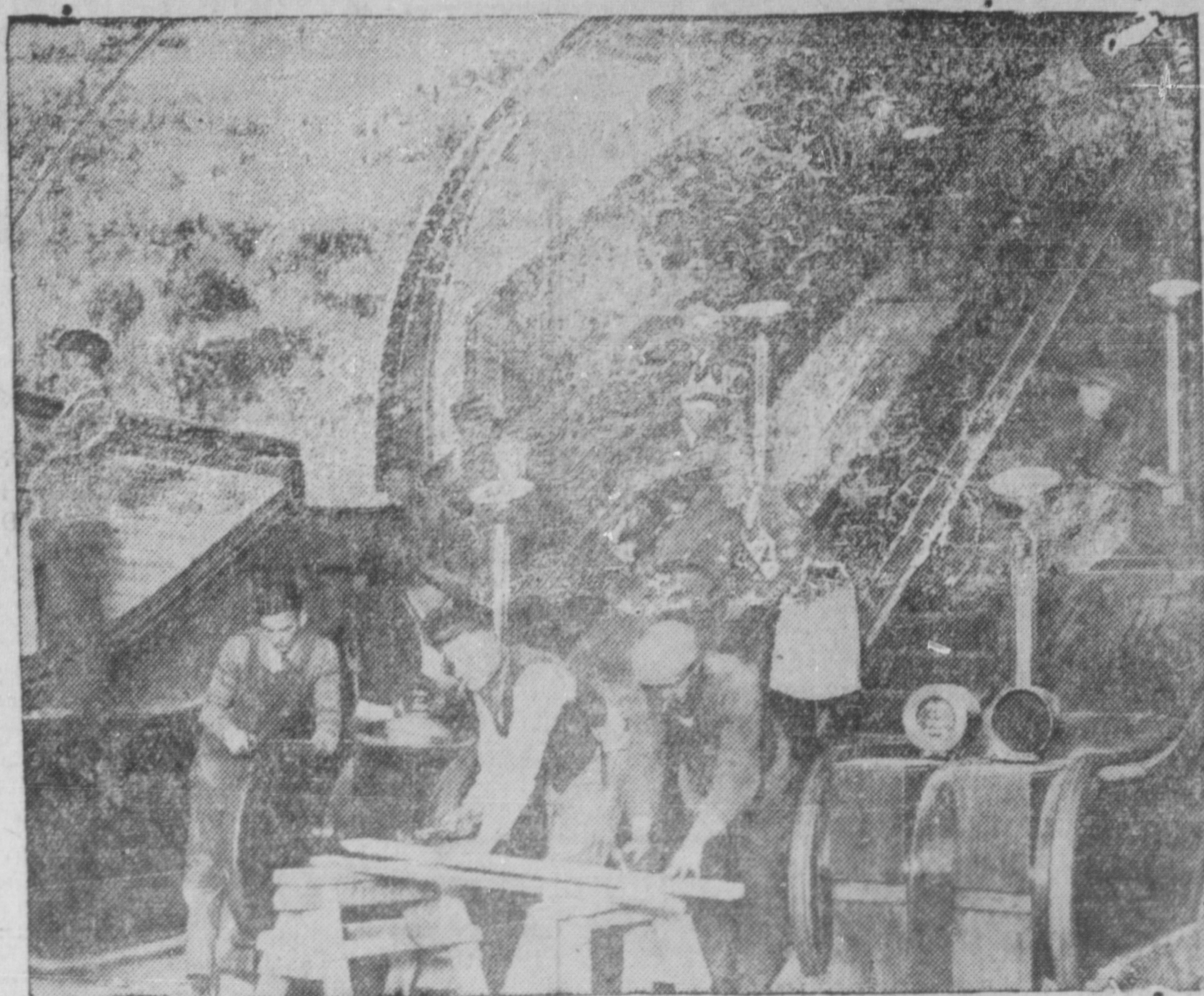
The above picture shows workmen putting the finishing touches to some of the escalators of the Piccadilly Circus New Underground Station, London, which has taken four years to build. This new station, cost more than $2,000,000 to construct.