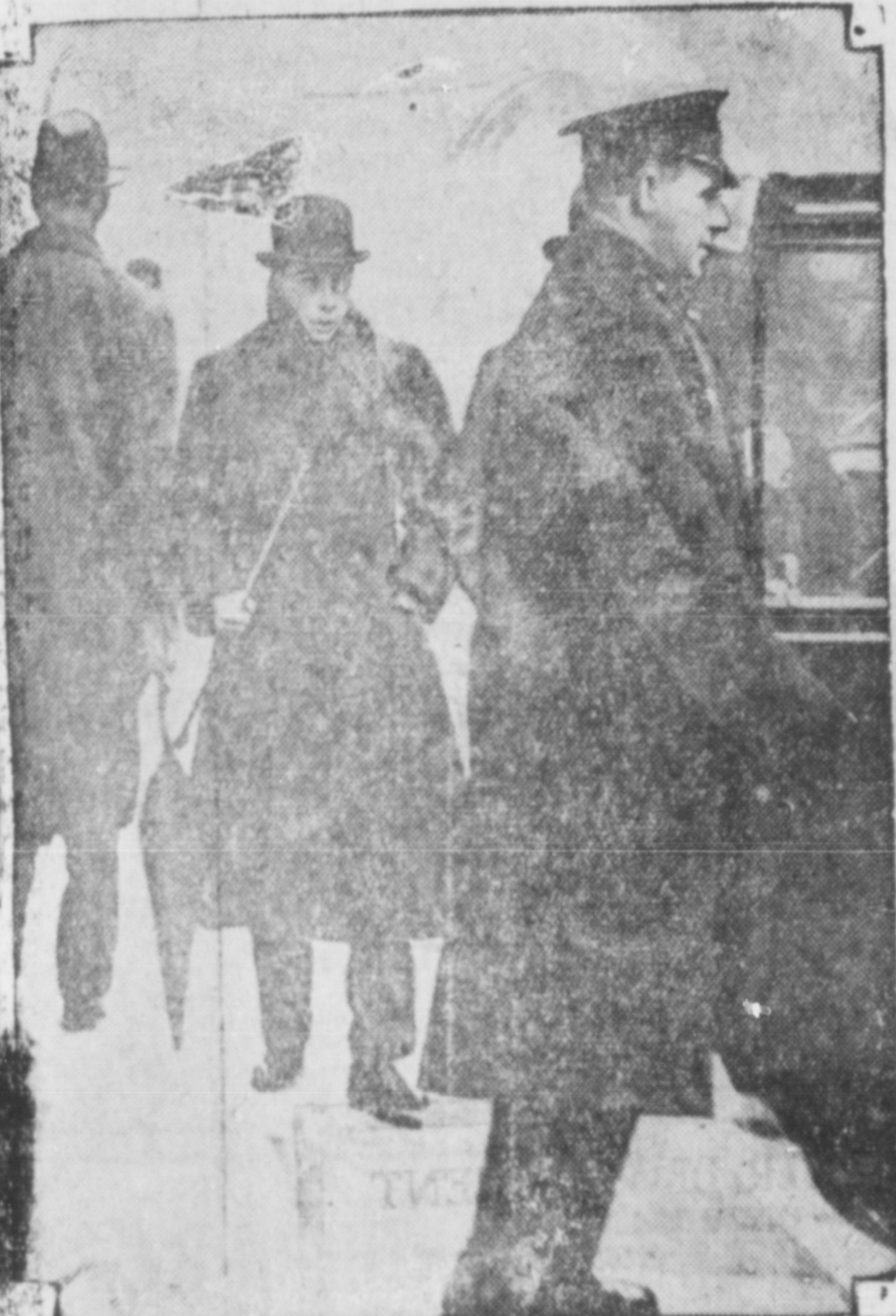
H.R.H. the Prince of Wales is here seen leaving Buckingham Palace to pay a visit to the Duke of York shortly after his 100-mile dash from the heart of the African big game country, to the bedside of his royal father. The popular heir-apparent, who has taken over the majority of the duties of King George, is credited with inspiring His Majesty's remarkable fight for life.