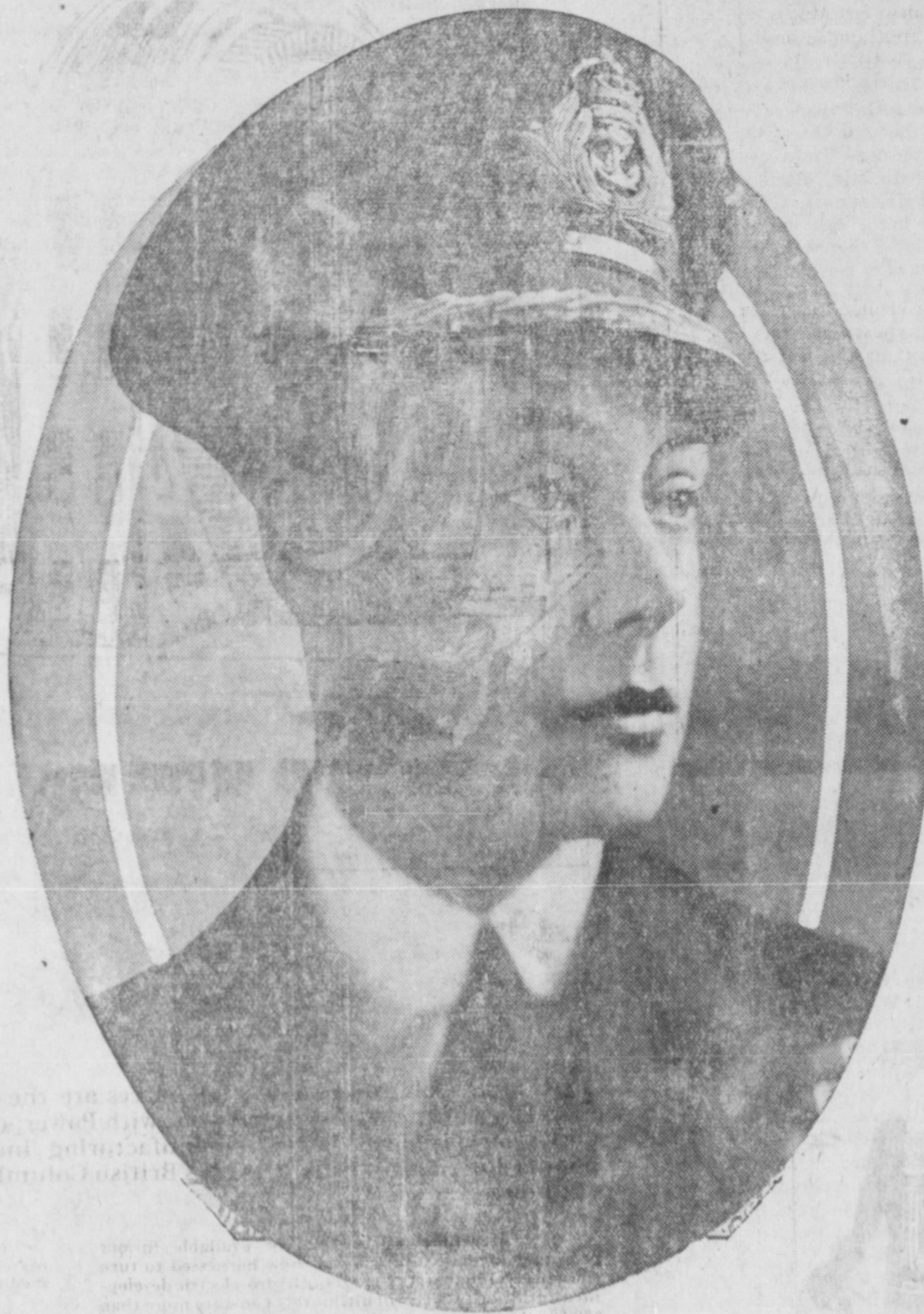
YOUNG TRANSCONTINENTAL FLYER REWARDED