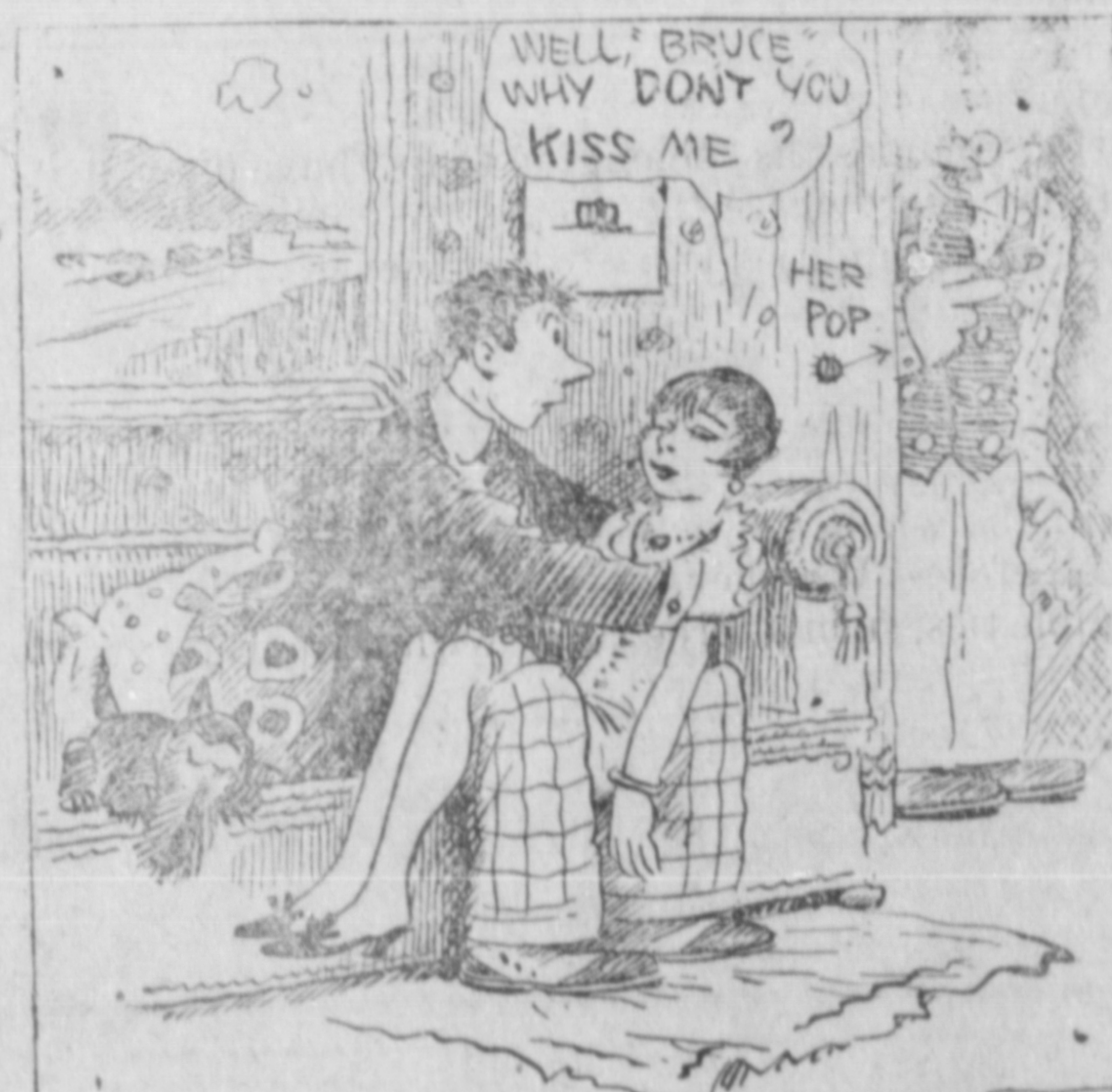
© 1929 by King Features Syndicate, Inc. Great Britain rights reserved.