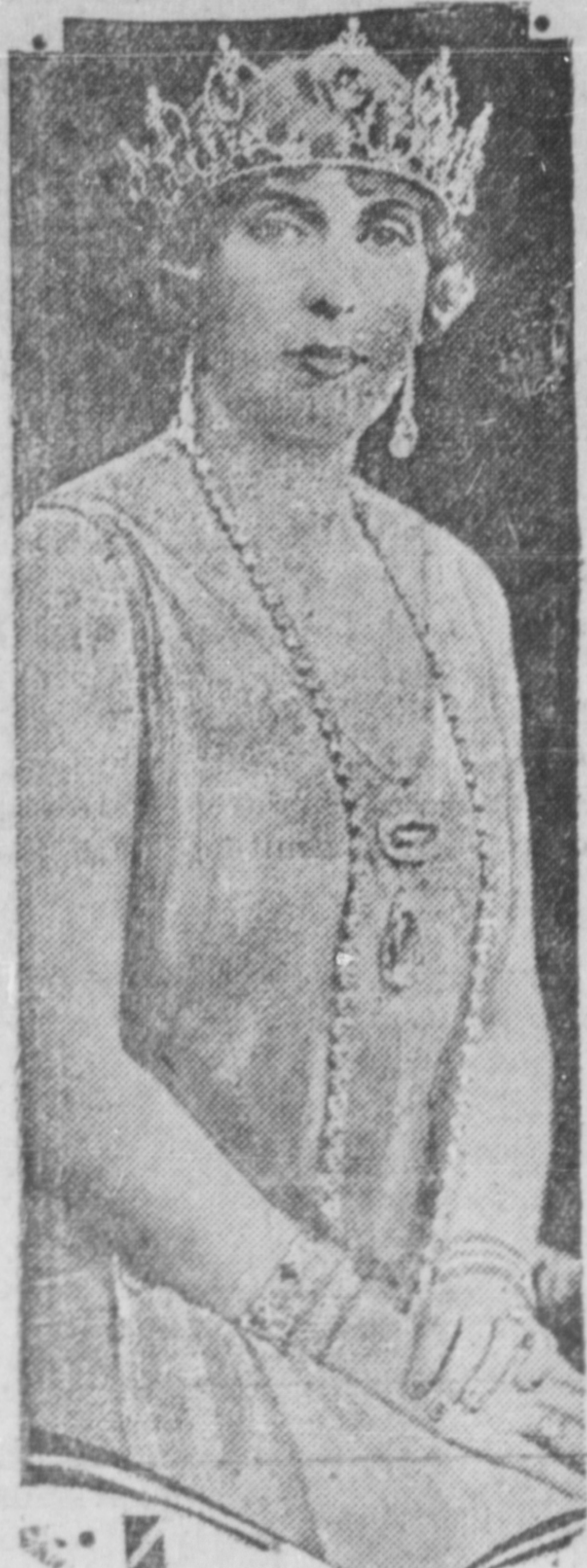
Her Majesty, Queen Victoria of Spain.